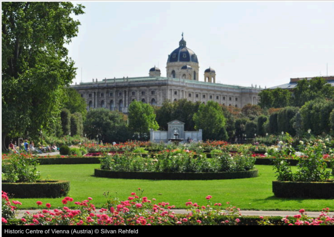
Historic Centre of Vienna (Austria)

English French Arabic Chinese Russian Spanish Japanese Dutch