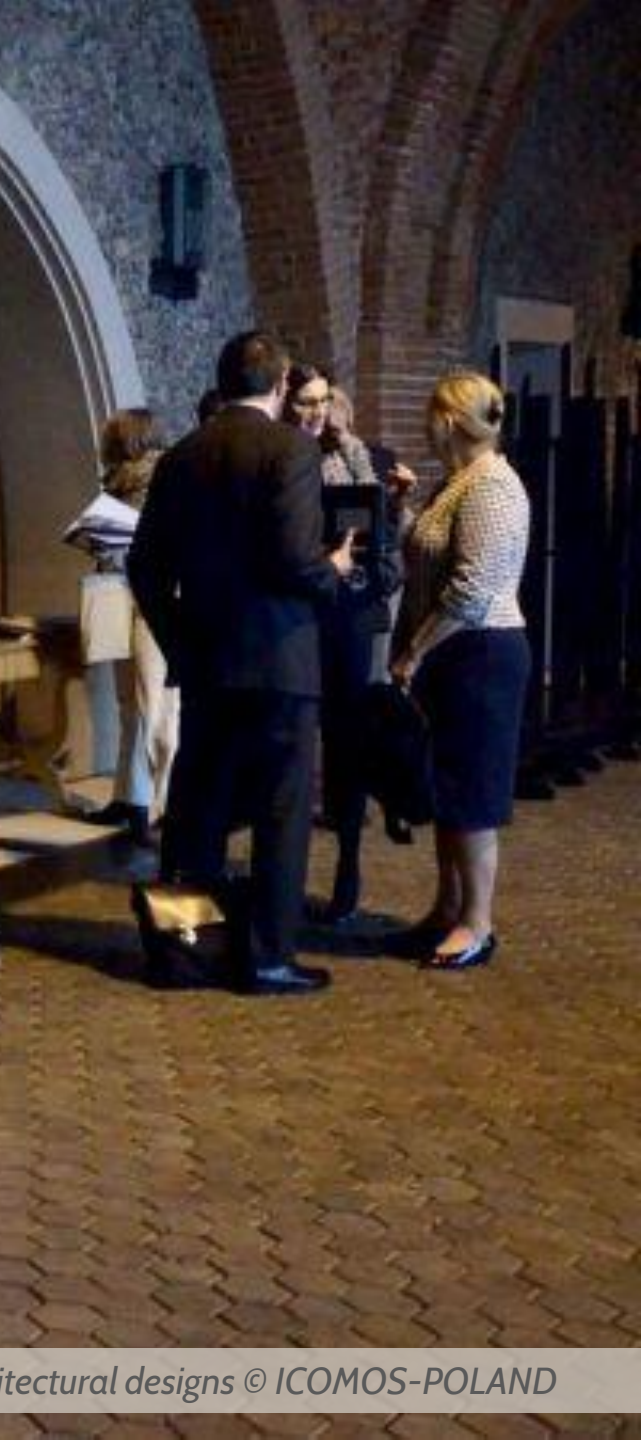
Exhibition of the best architectural designs