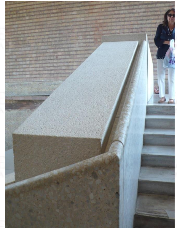
A detail of the modern handrail (CB 2018)