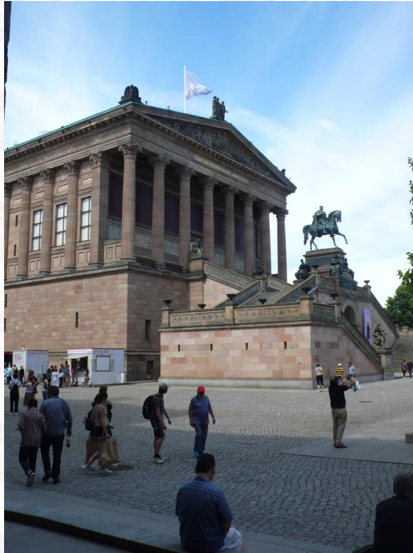
Pergamon Museum (CB 2017)