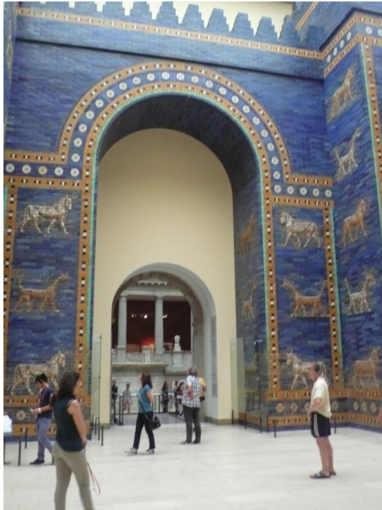
Reconfiguration of the ancient Babilonia monuments (CB 2018)