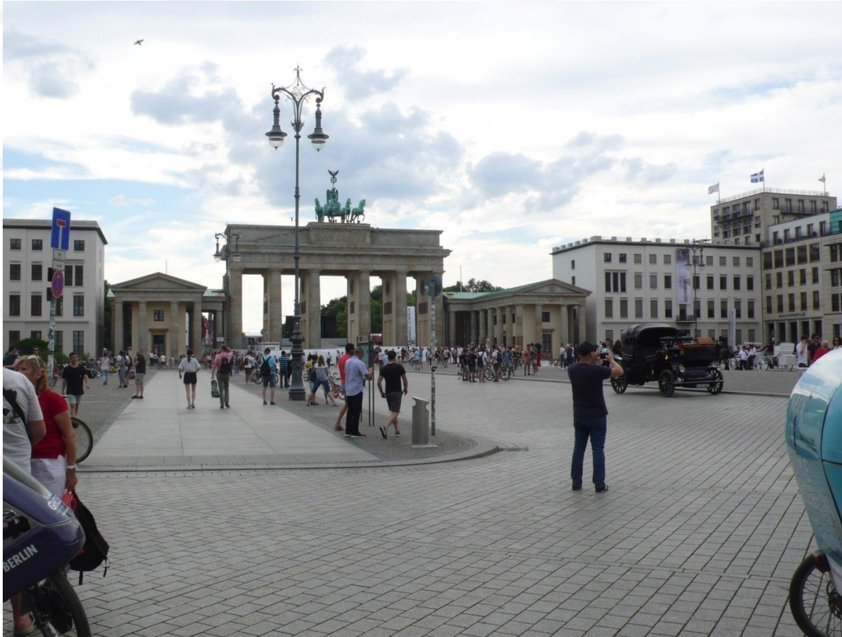
Introduction to a touristic city (CB 2018)