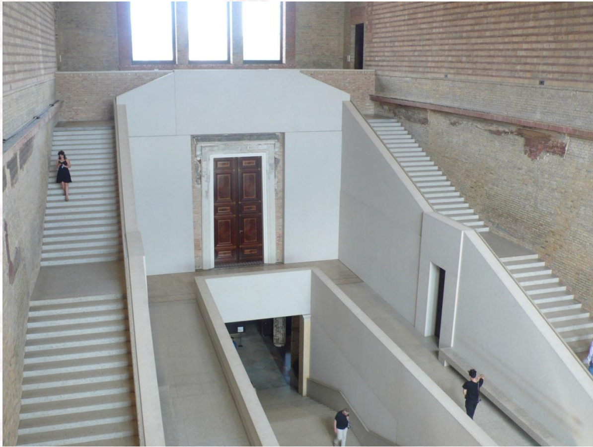
The insertion of the new main staircase (CB 2018)