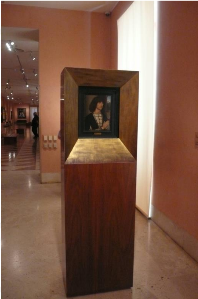
Details of the exposition (CB 2016)