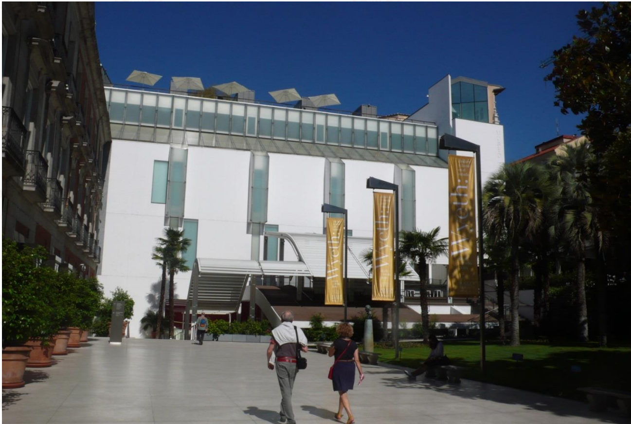
The access to the new museum (CB 2016)