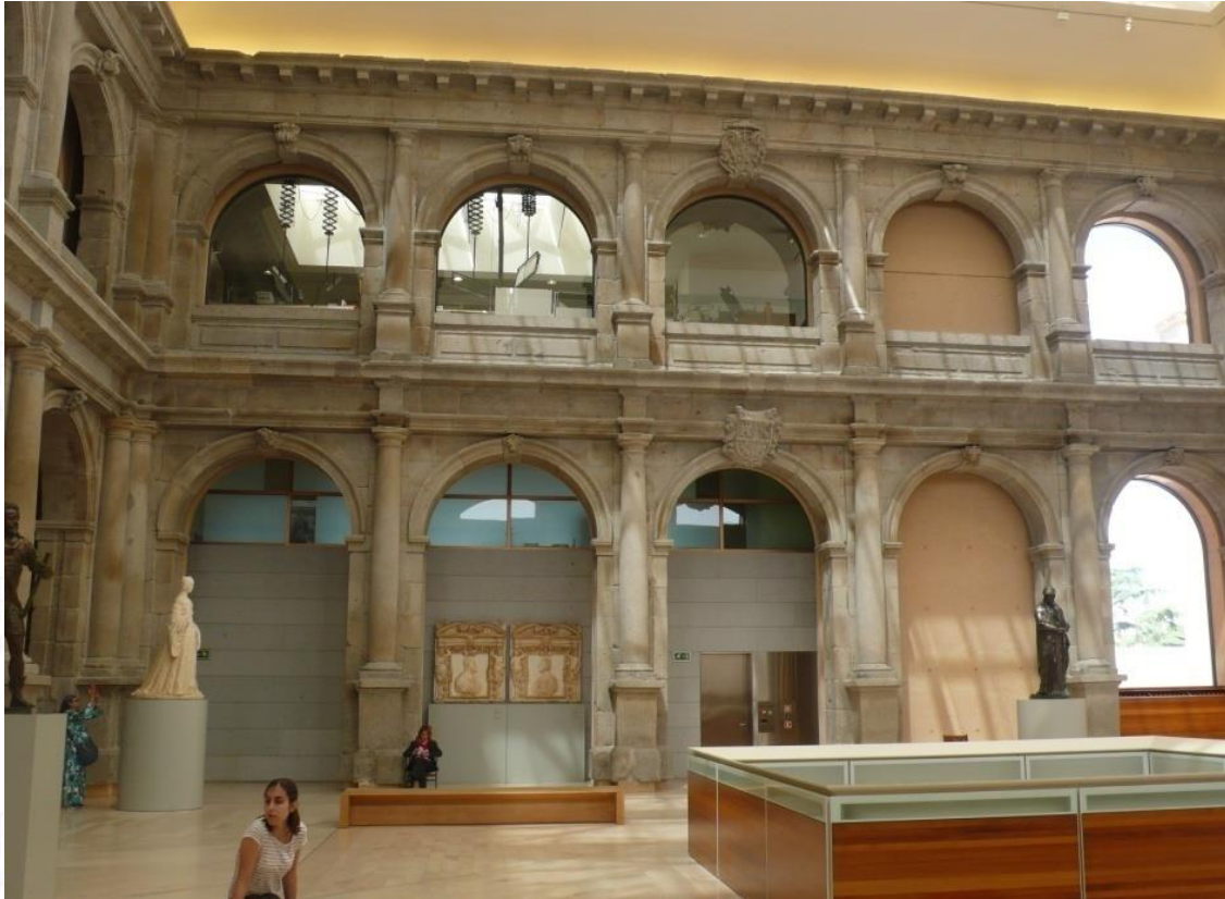
New/old cloister of Jeronimos (CB 2016)