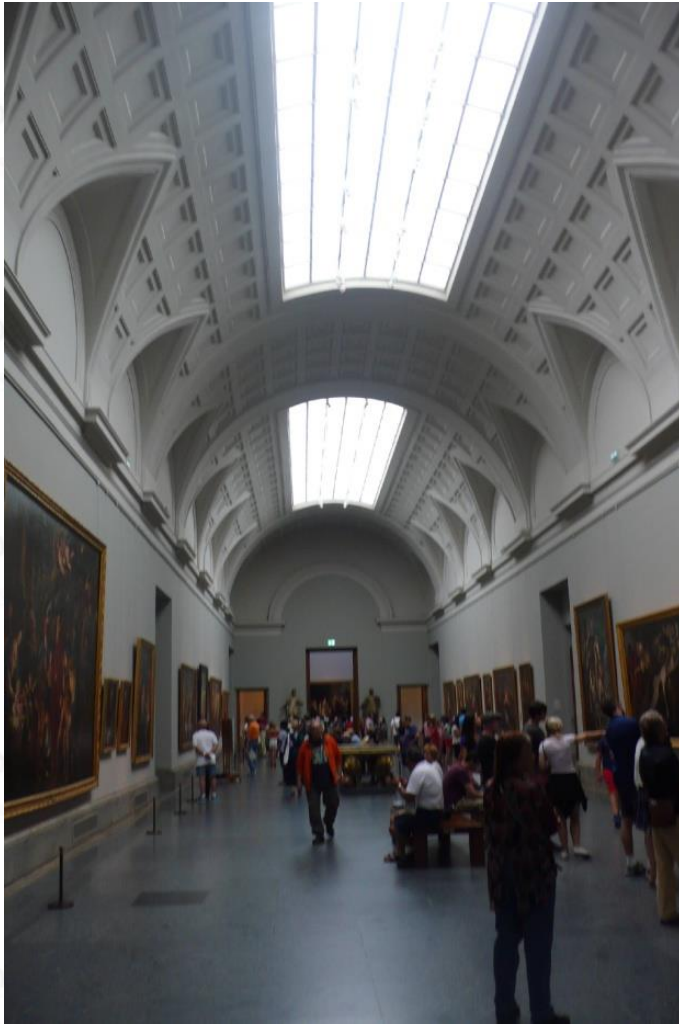
The fluxe of the tourists (CB 2016)