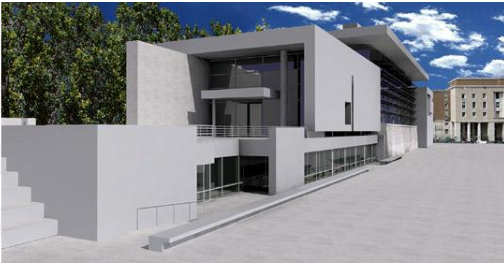
Richard Meier project