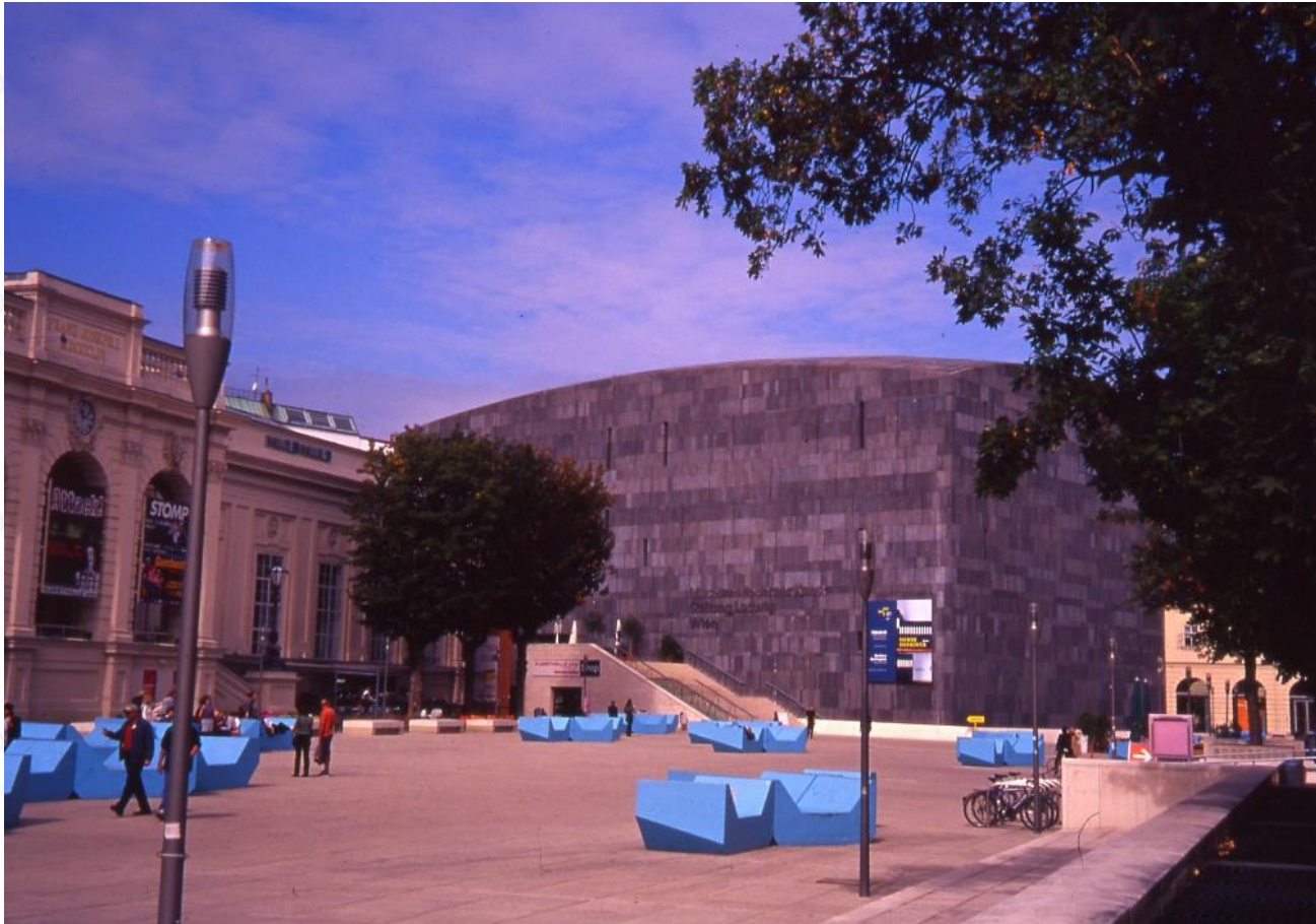
New space for cultural use (CB 2004)