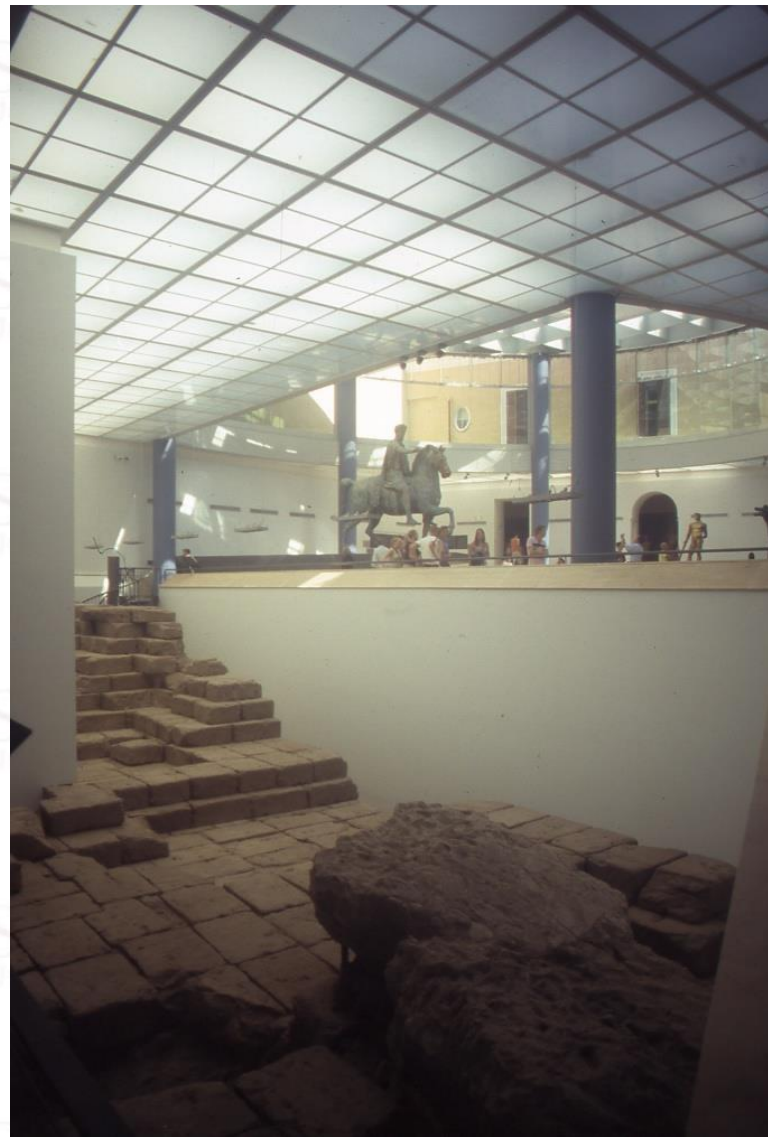
Campidoglio, Tempio di Giove, new excavation (CB 2005)