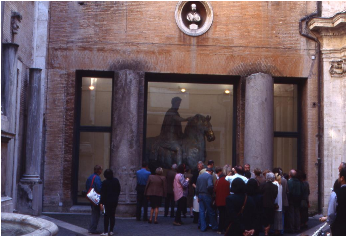
Marco Aurelio in temporary presentation during work in progress... (CB 1992)