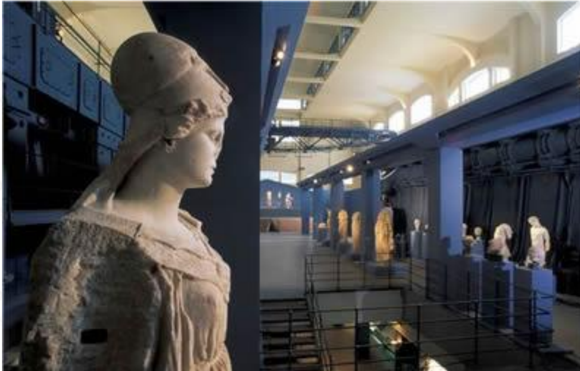
Detail between Roman marble and industrial archaeological (CB 1997)