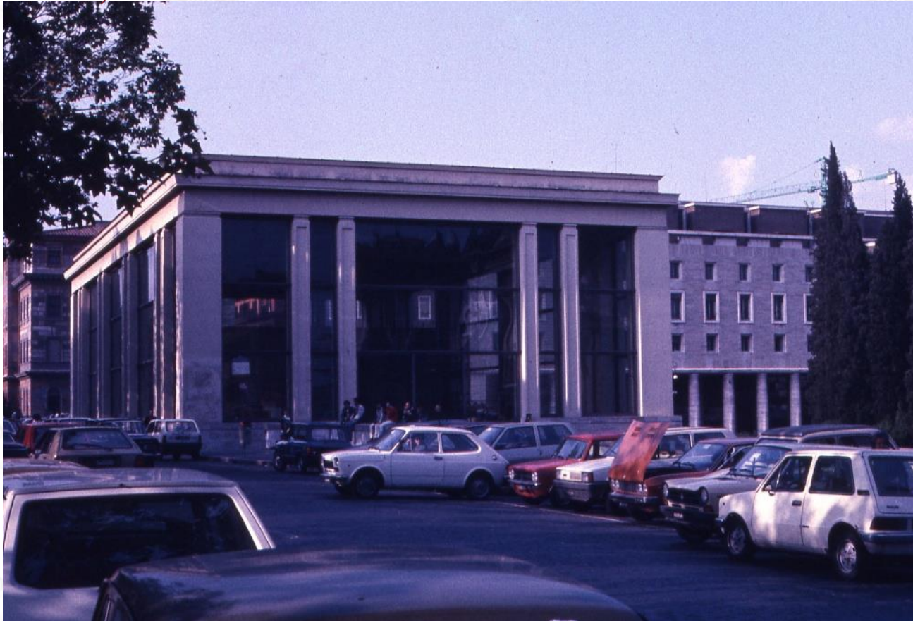
Morpurgo Pavillon (1938), destroyed (CB 1980)