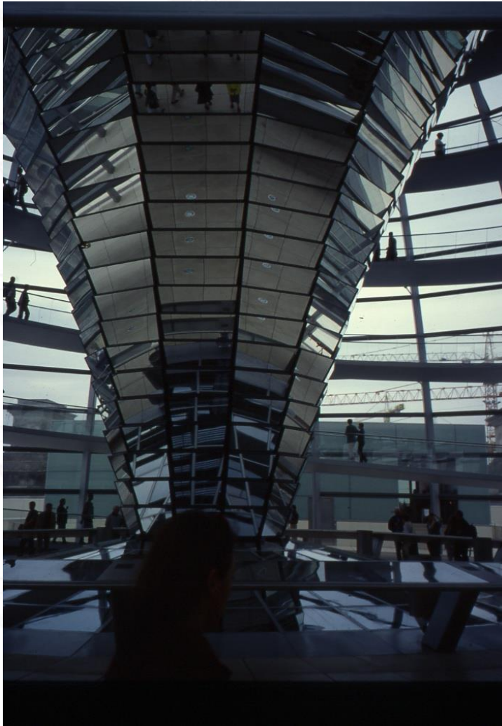
Detail of mirrors (CB 1999)