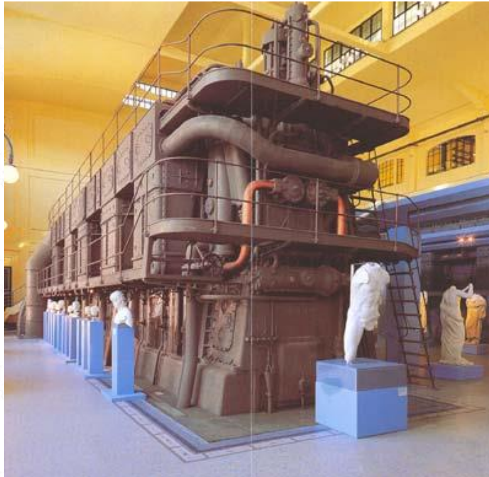
Detail, turbine and classic fragment (CB 1997)