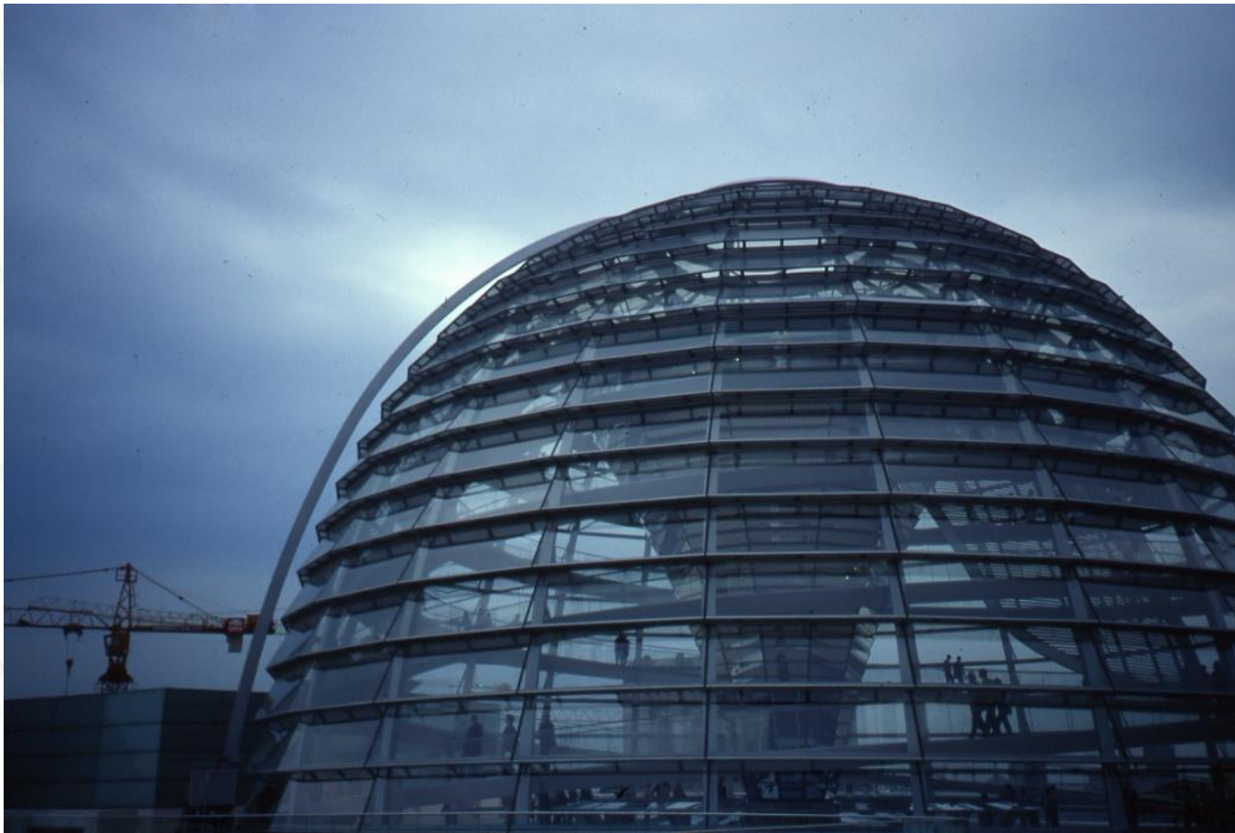
The insertion of new Dome (CB 1999)