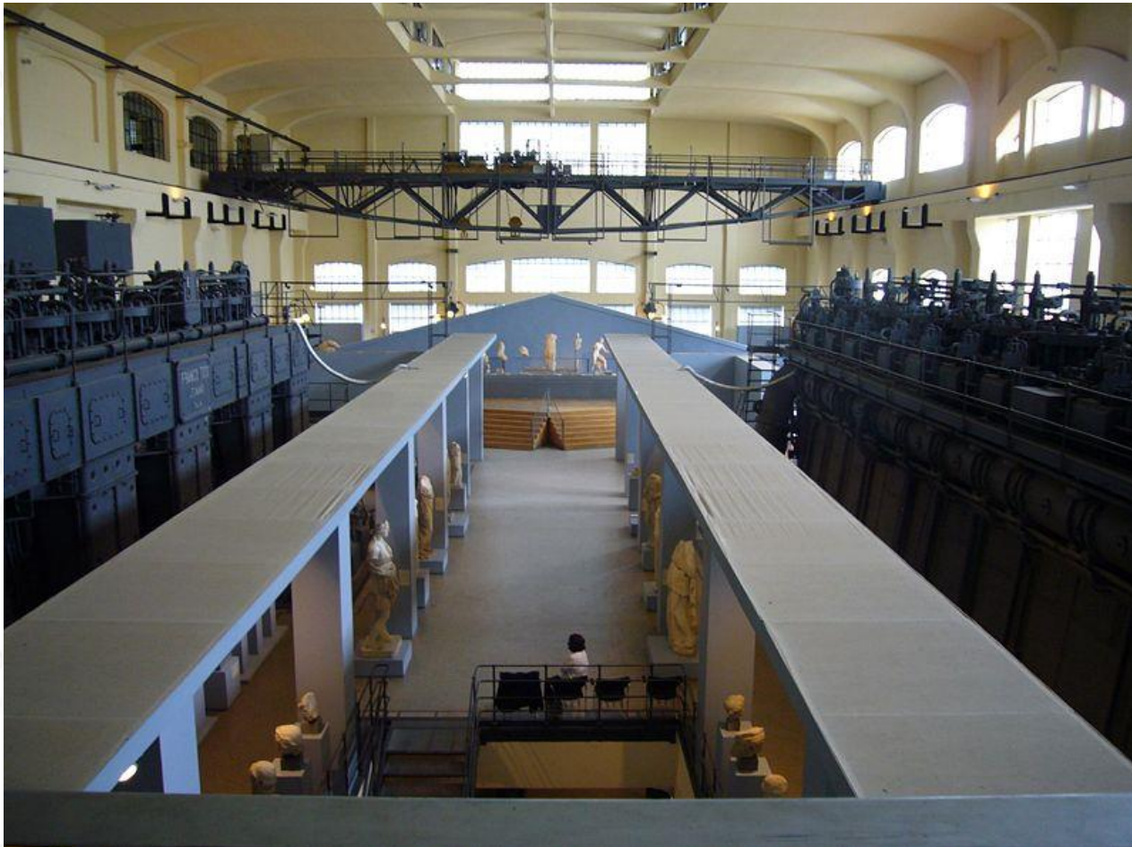
Museum adaptation with classical sculpture (Apollo Sosiano) and model space (CB 1997)