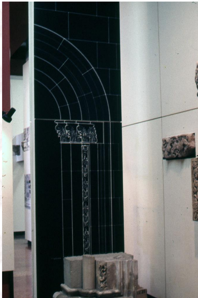
Details, didactic image (CB 1980)