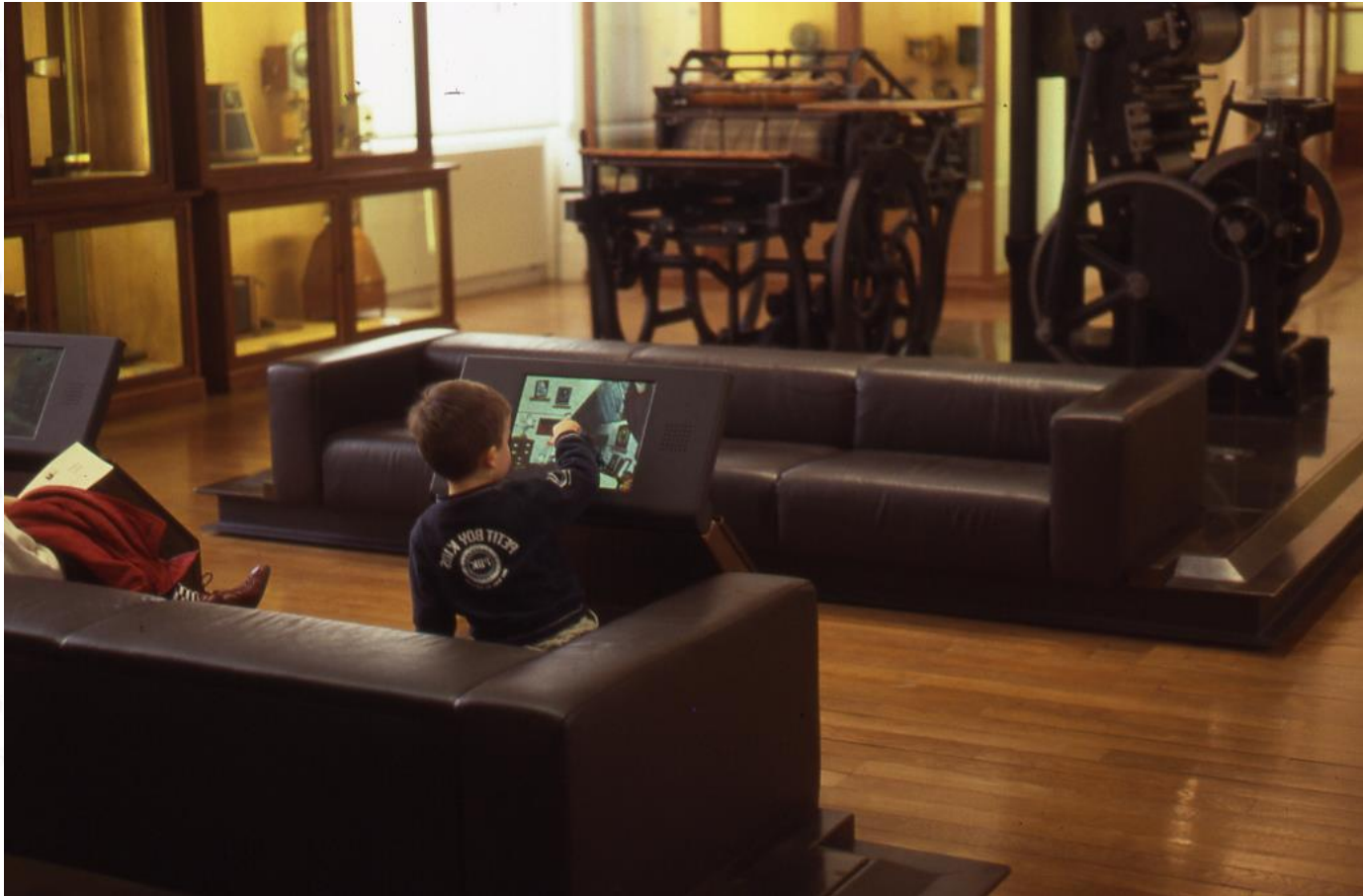
Detail of touch-screen didactic facilities (CB 2008)