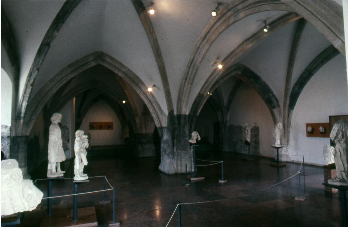
The Historic Museum, some problems with the lighting (CB 1980).