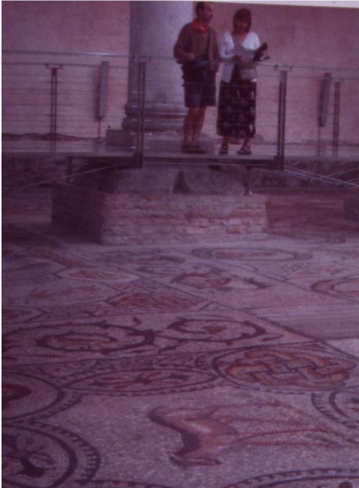
Cathedral insertion of walkway for protection of the mosaic. (CB 2008)