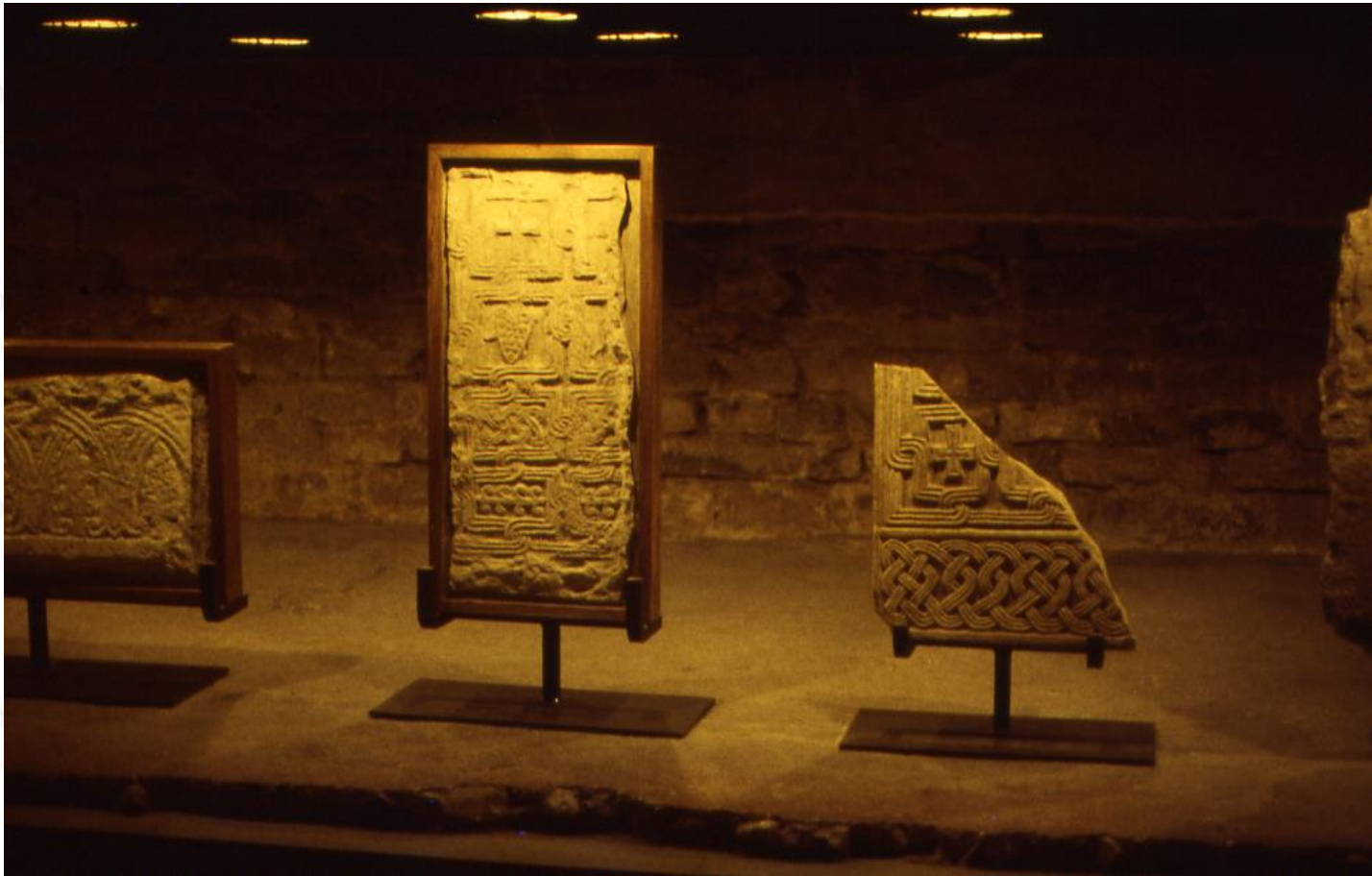
Details of ancient "plutei" (CB 1992)