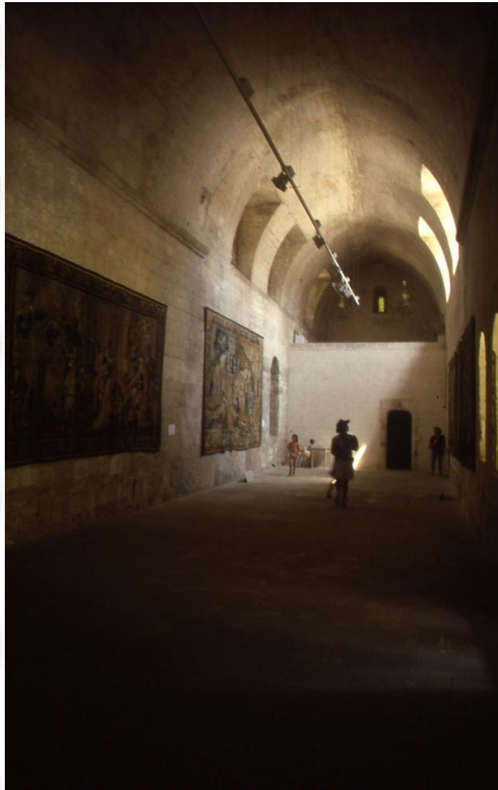
The tapestry (CB 1994).