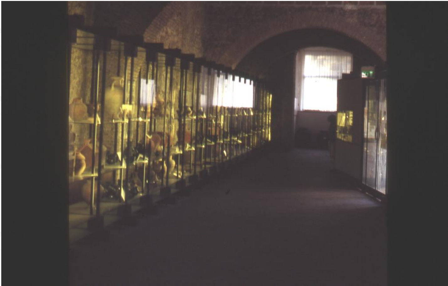
Ground floor a show-glass, designed by Franco Minissi (CB 2005)