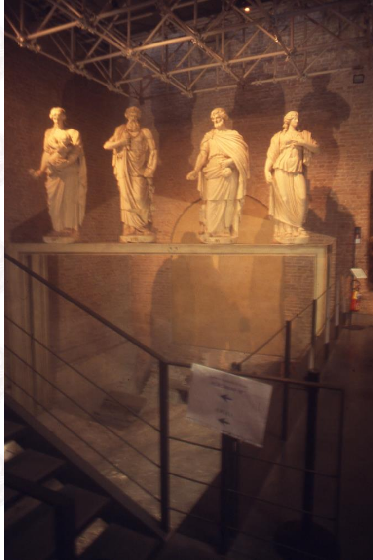
Detail of same sculptures (CB 2005)