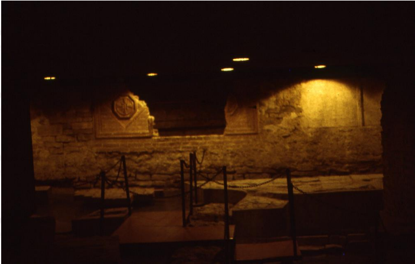
Underground fragment of ancient Santa Reparata (CB 1992)