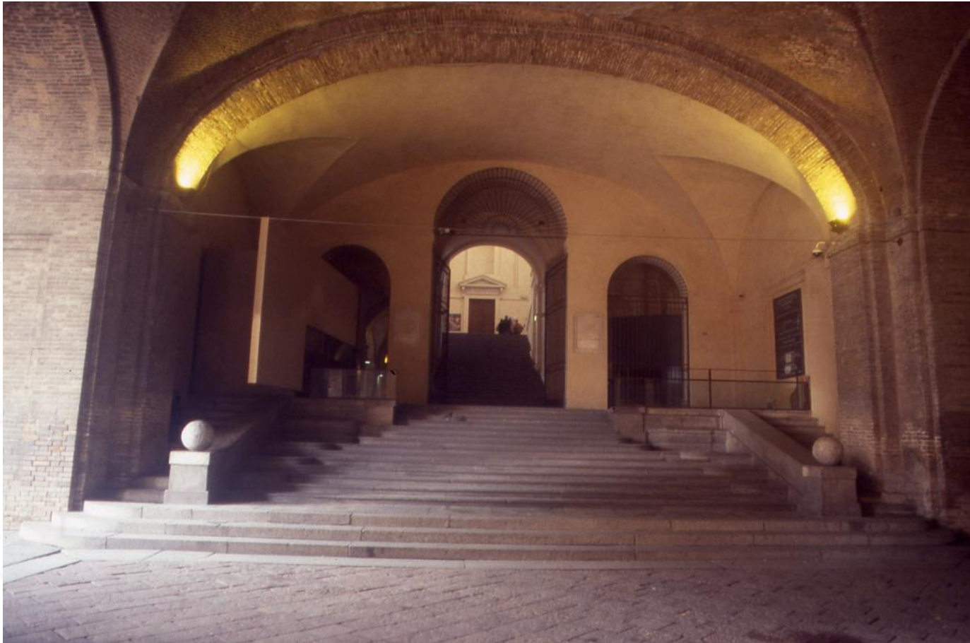
Palazzo Gran Ducale – Main access (CB 2005)