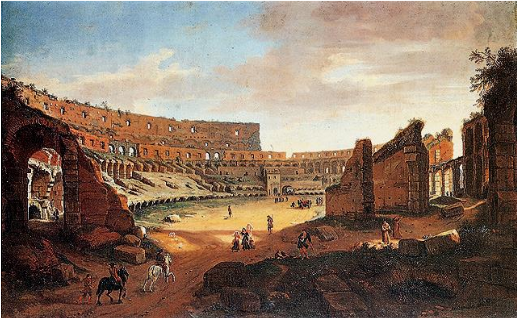
Gaspar van Wittel, L'interno del Colosseo