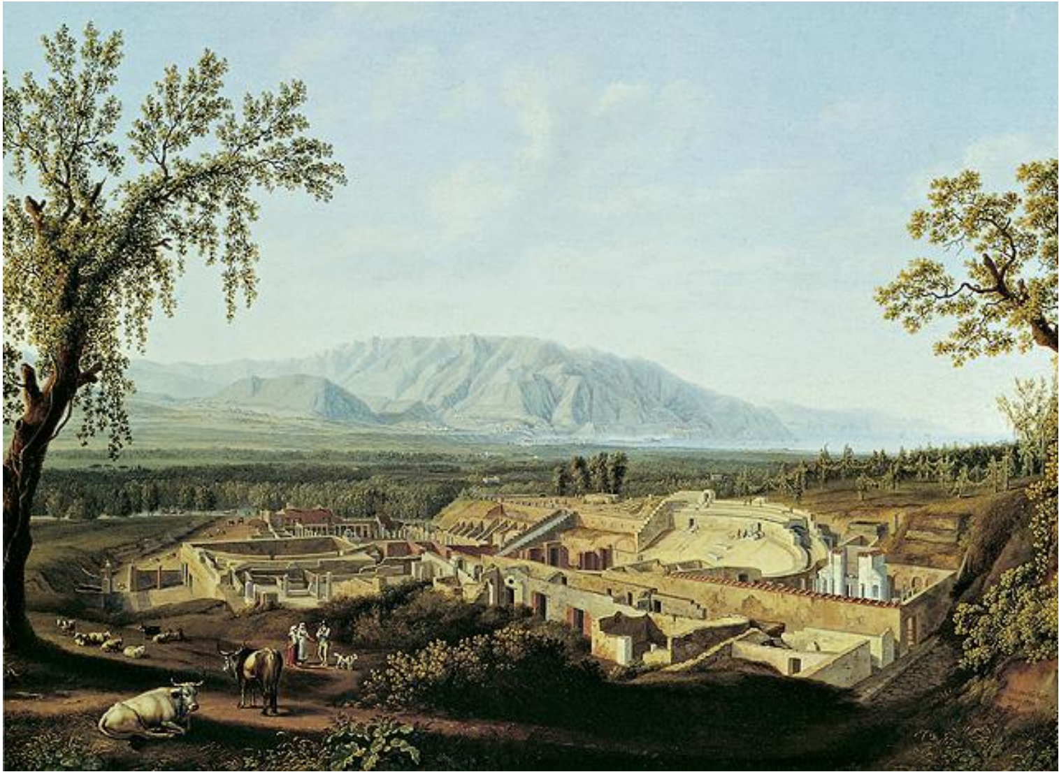
Jakob-Philipp Hackert, Le rovine di Pompei , 1799