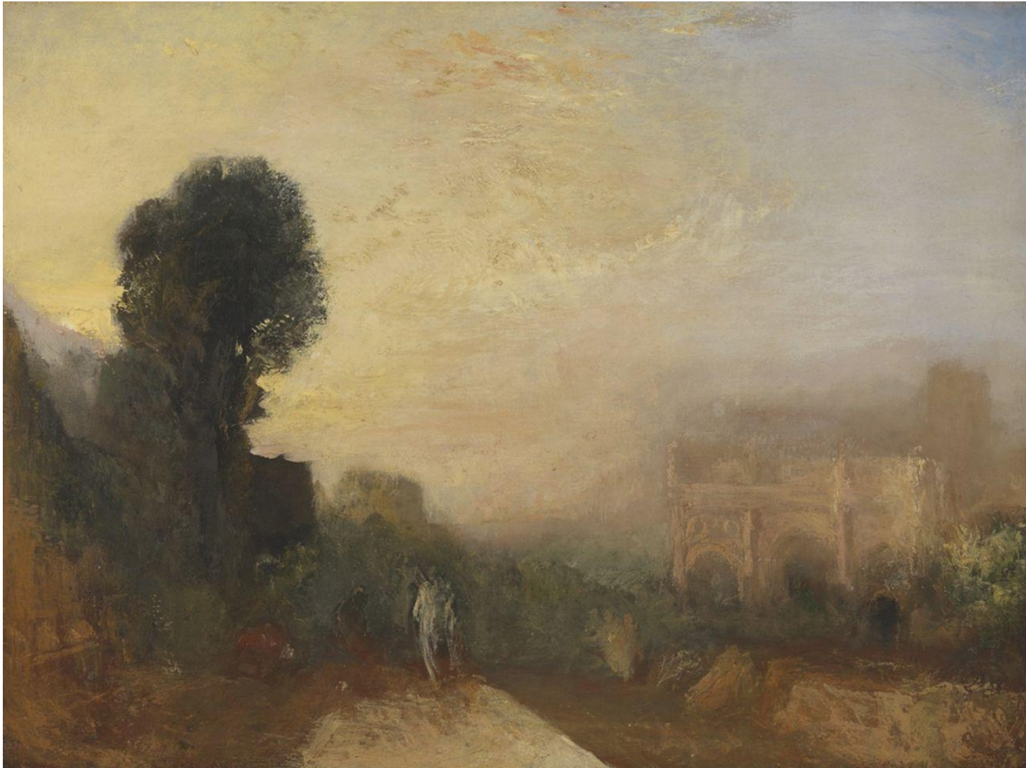
Joseph Mallord William Turner, The Arch of Constantine, Rome, 1835