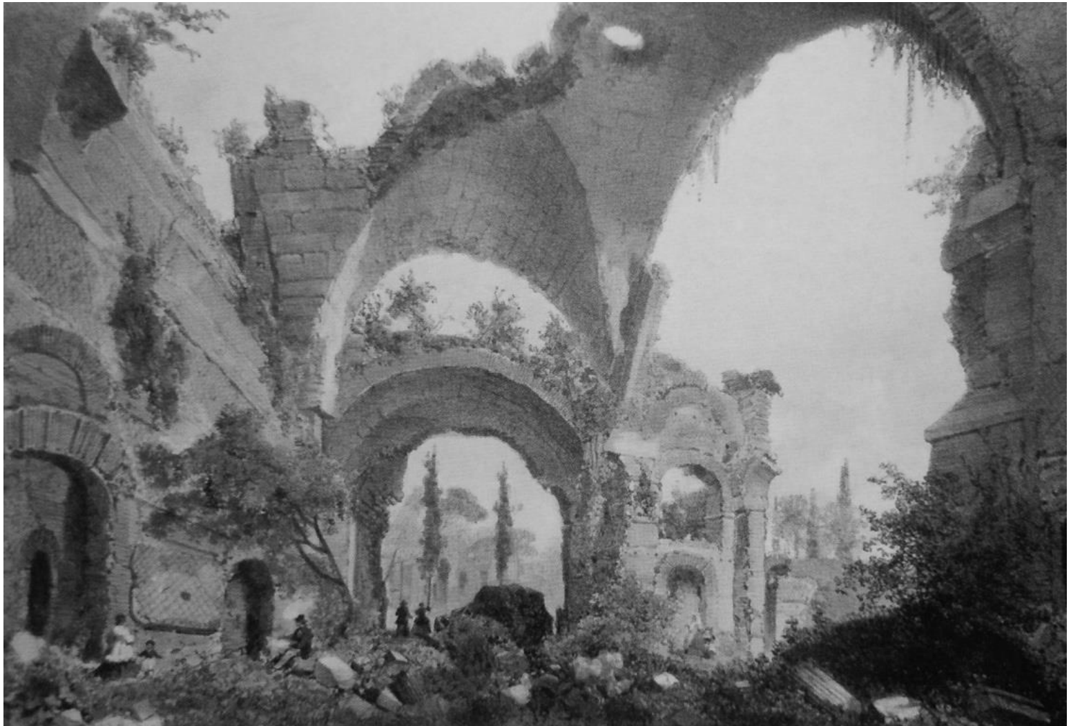
Leon Jean-Baptiste Sabatier, Avanzi di villa Adriana presso Tivoli, litografia, 1870