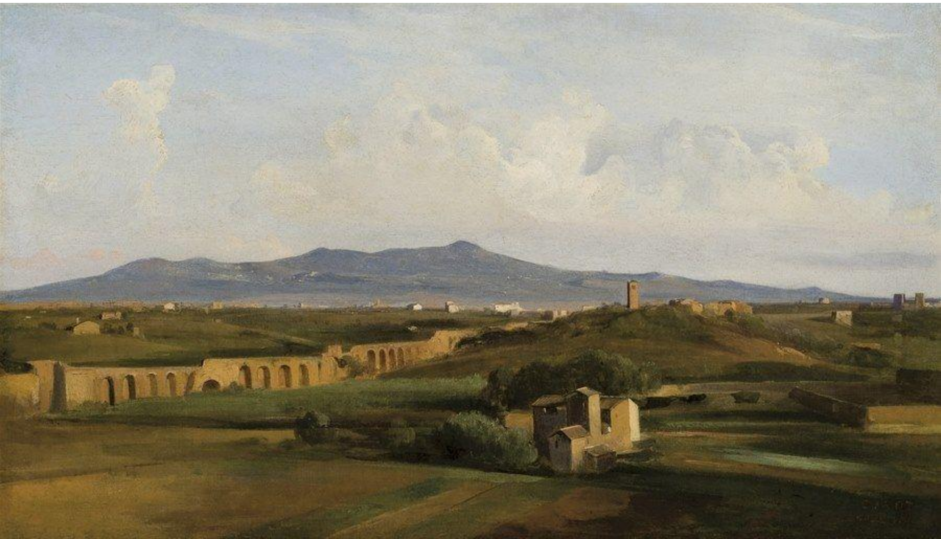
Camille Corot, Claudian Acqueduct Towards Monte Cavo