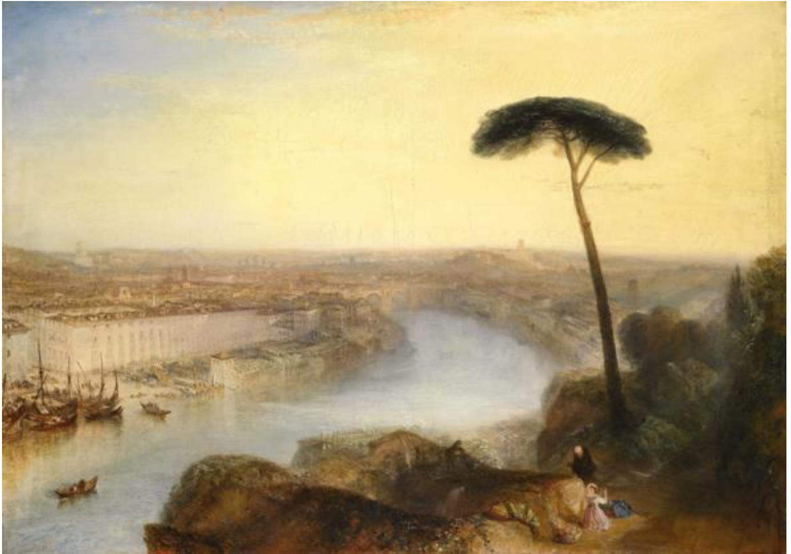
Una veduta di Roma dall'Aventino, Joseph Mallord William Turner