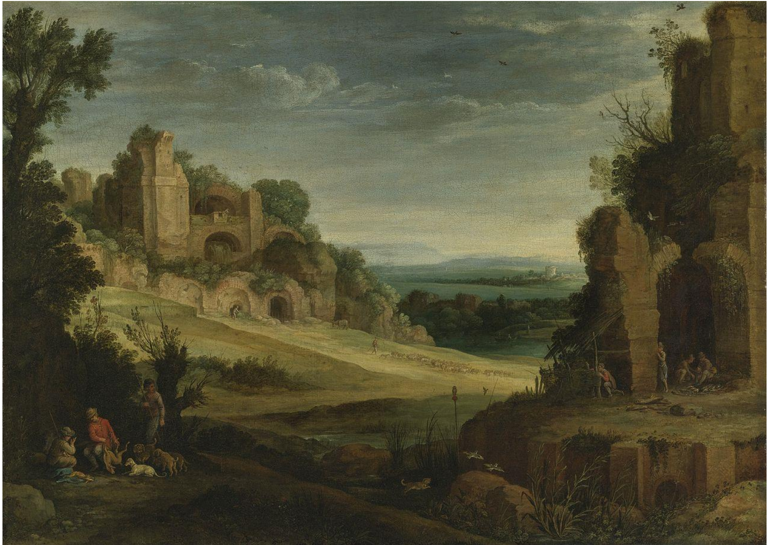
Paul Bril, Landscape with a hunting party and Roman ruins