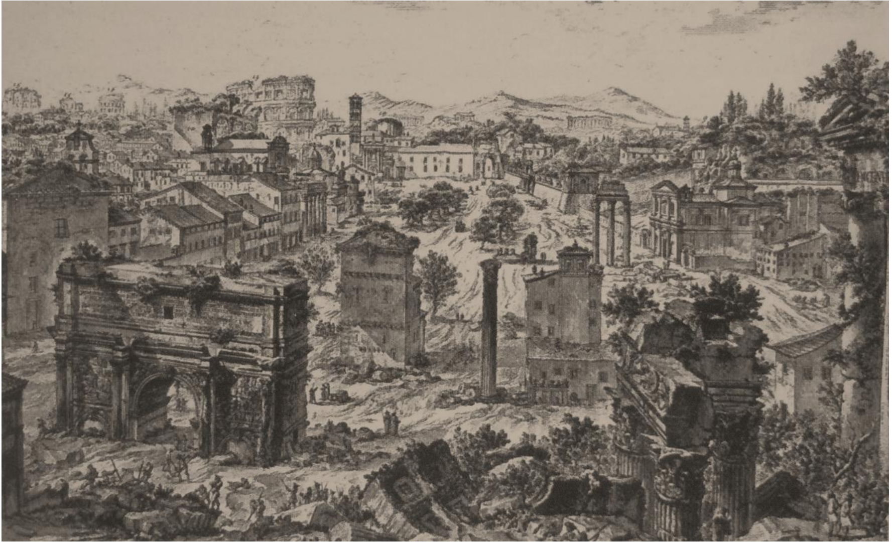
Giovan Battista Piranesi, il Foro nelle vedute di Roma (1775).