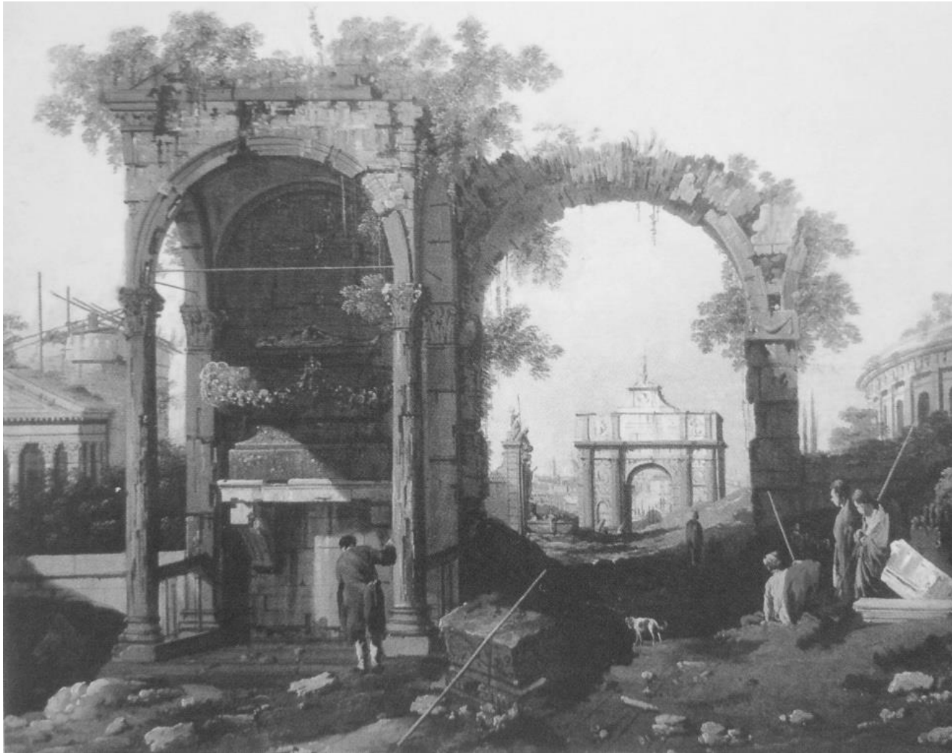
Canaletto, Capriccio con modelli classici (1734 circa), Venezia, Galleria dell'Accademia