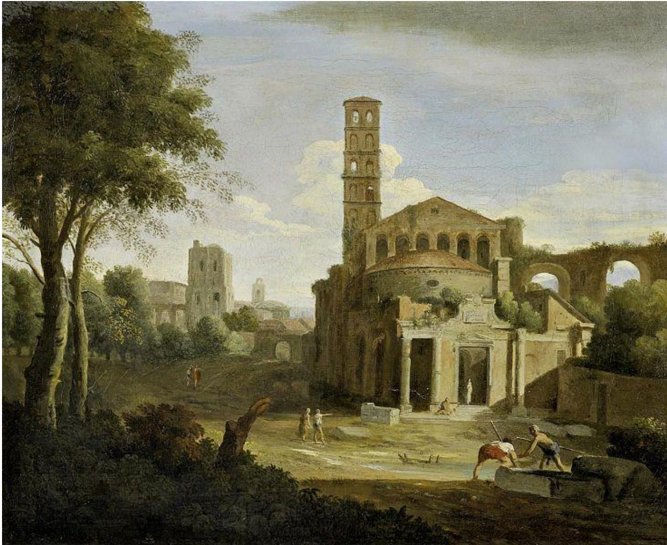
Sebastiano Ricci, Ruin landscape (XVIII c.)