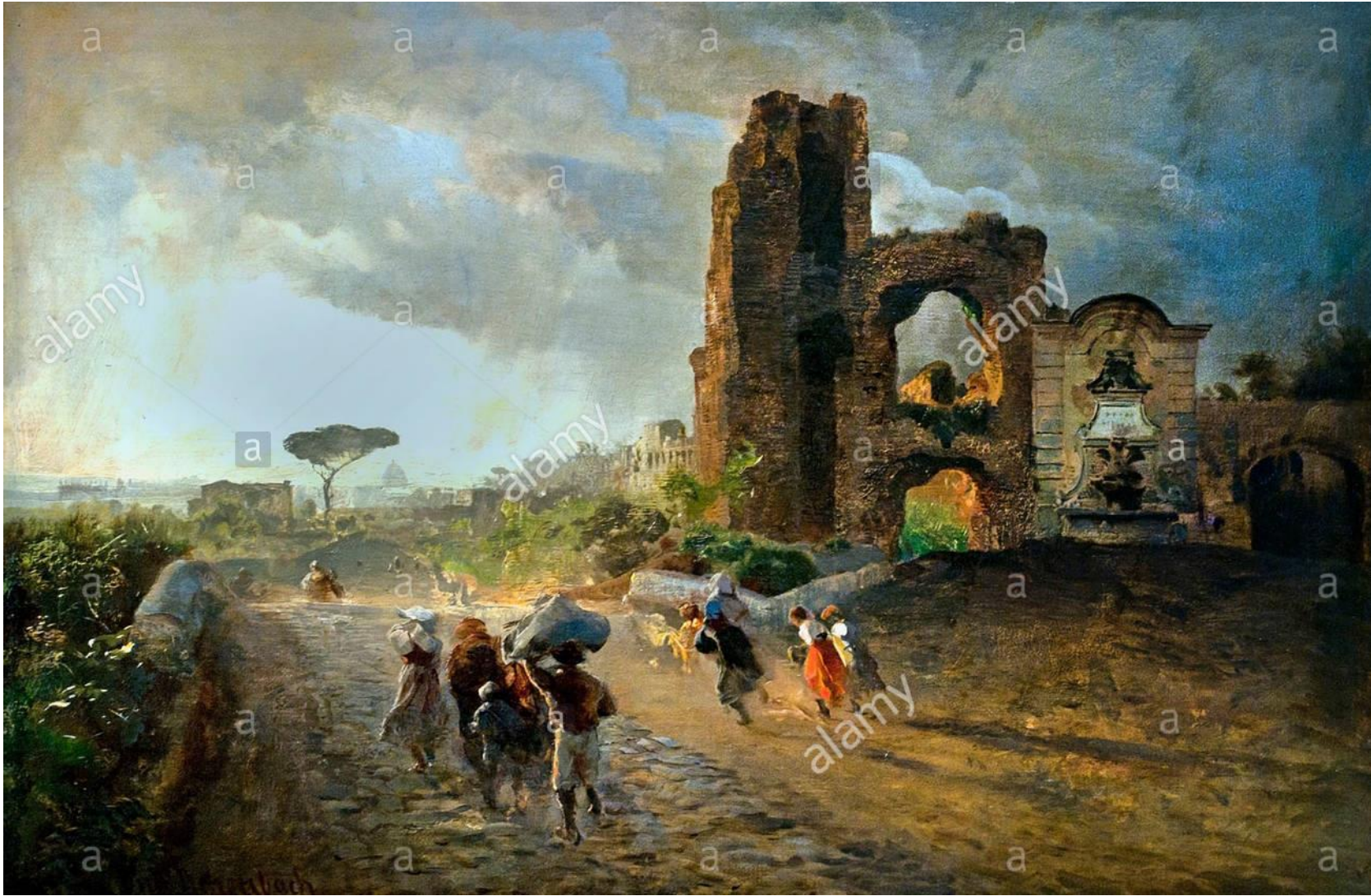
Oswald Achenbach, Porta furba