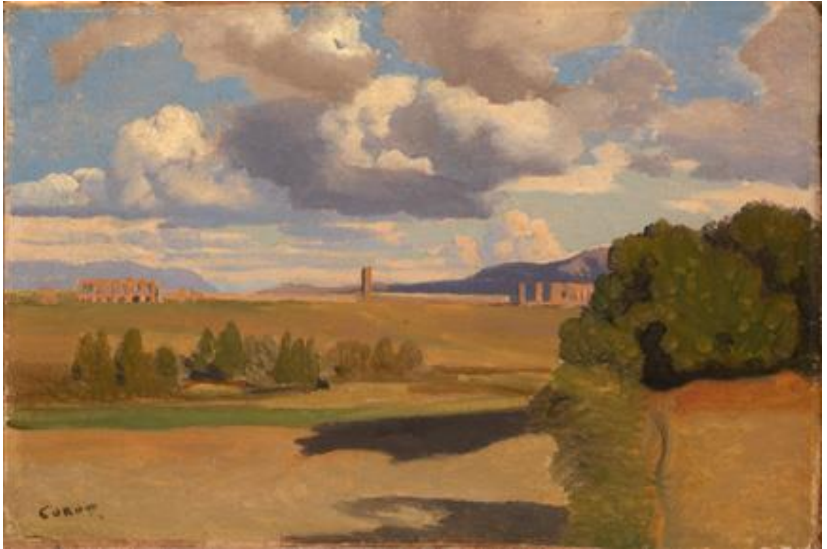
Camille Corot, The aqueduct