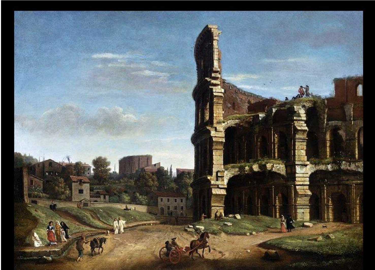
Gaspar van Wittel, Veduta del Colosseo