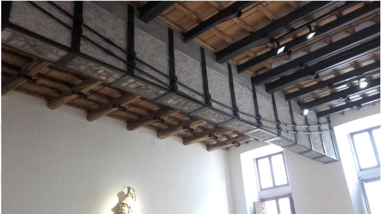
Rome, Palazzo Altemps. Consolidation of the roof of the second floor, with an innovative system (CB 2012).