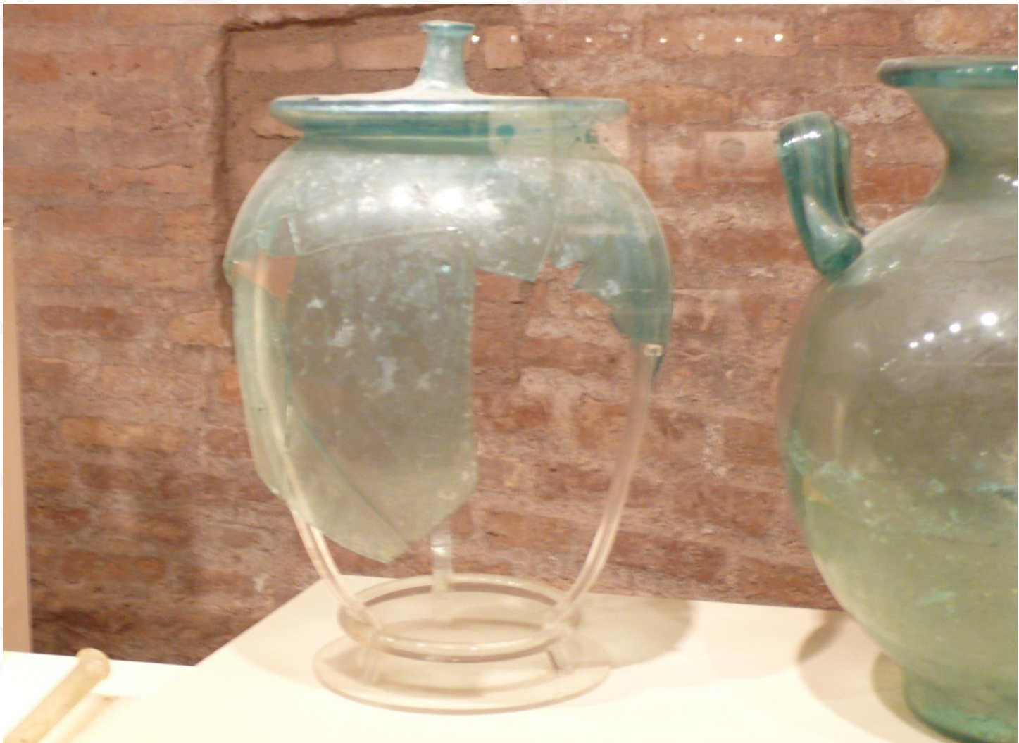
Detail of the antique vase with modern materials (CB 2009).