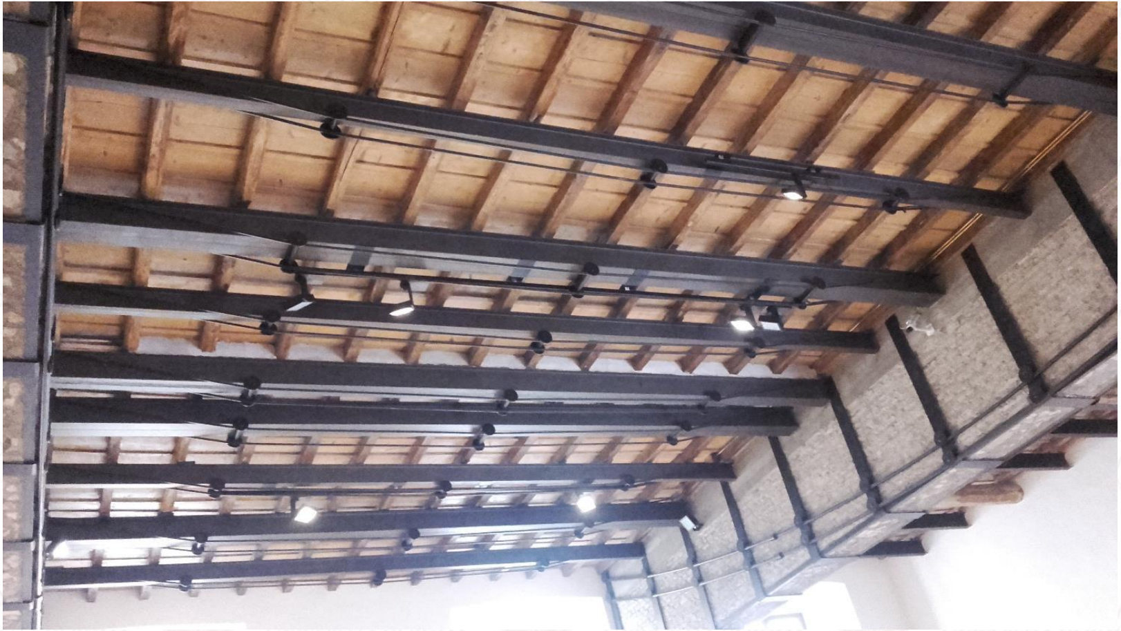
Rome, Palazzo Altemps. Consolidation of the roof of the second floor with steel insertion (CB 2012).