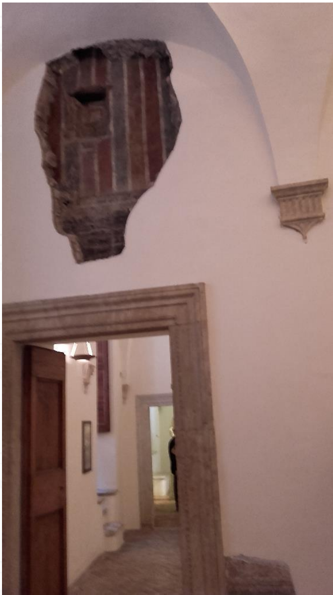
Rome, Palazzo Altemps, ground floor. The evidence of the ancient preexistence (CB 2012).