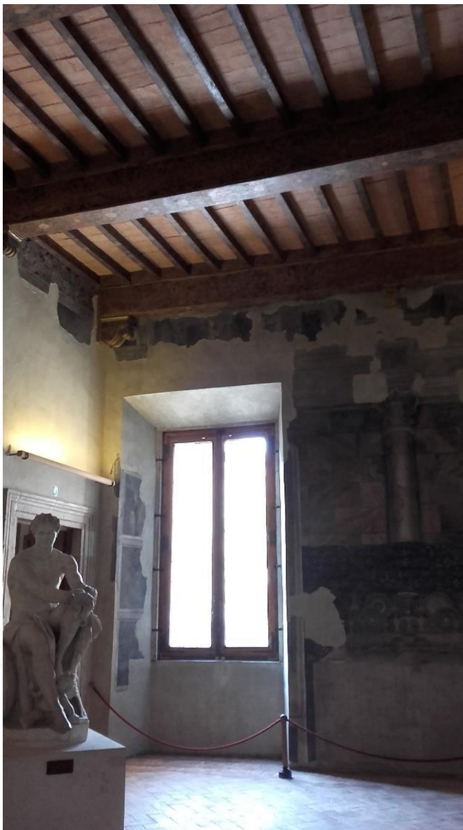
Rome, Palazzo Altemps, “piano nobile” (CB 2012).