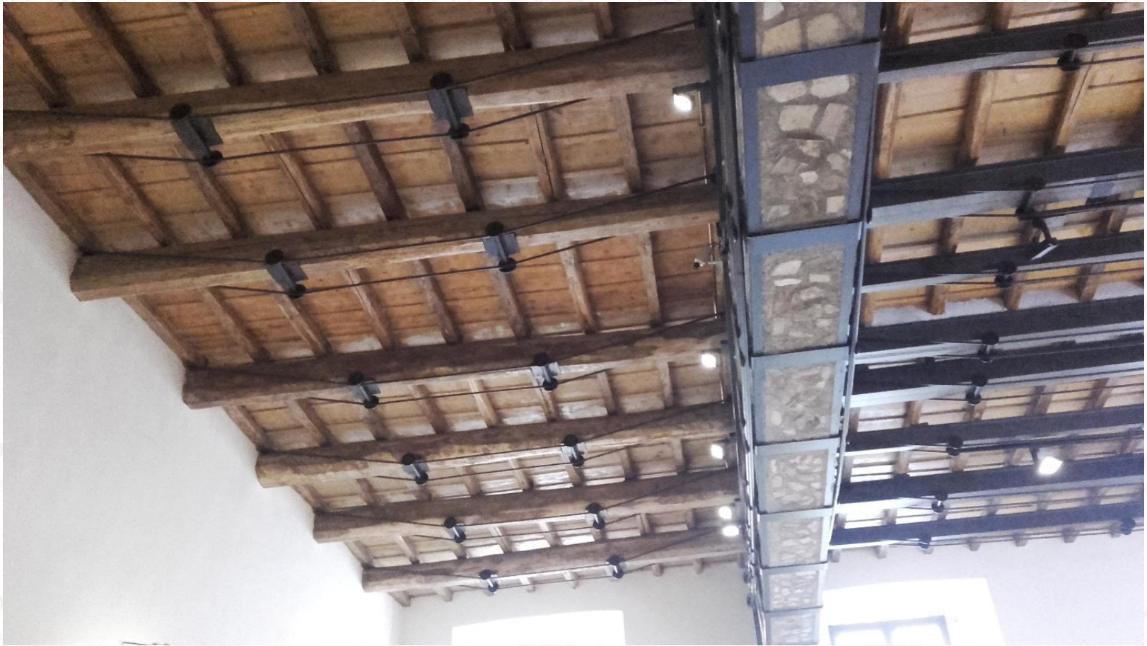
Rome, Palazzo Altemps. Consolidation of the roof of the second floor: two different system for conserve the authentic wooden floor. (CB 2012).