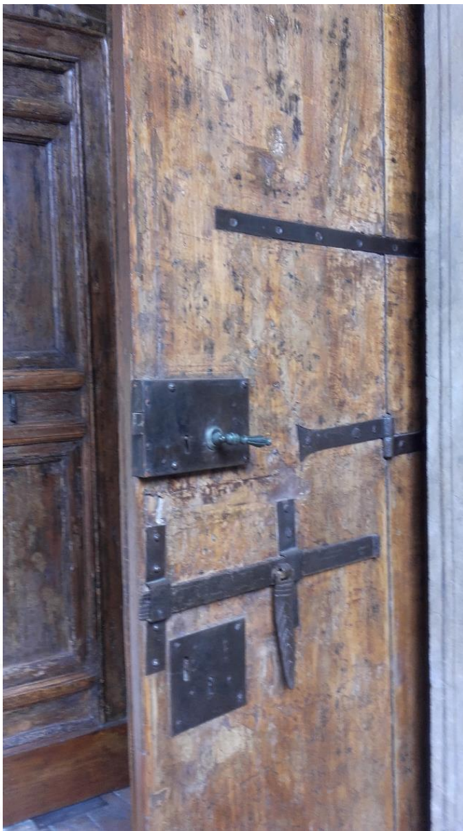
Rome, Palazzo Altemps, “loggia”. The importance of the conservation and restoration of the ancient window frame (CB 2012).