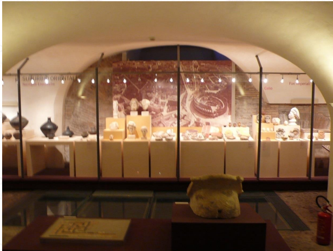
The new show glasses under the level of the street (CB 2009).