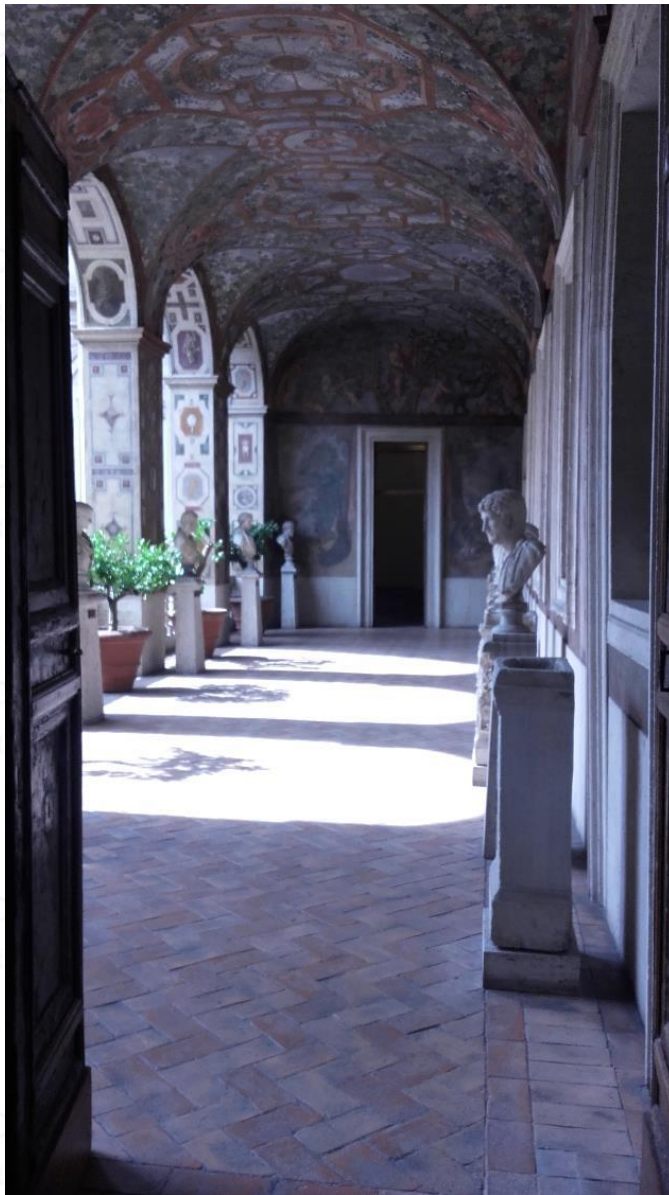
Rome, Palazzo Altemps, first floor loggia (CB 2012).