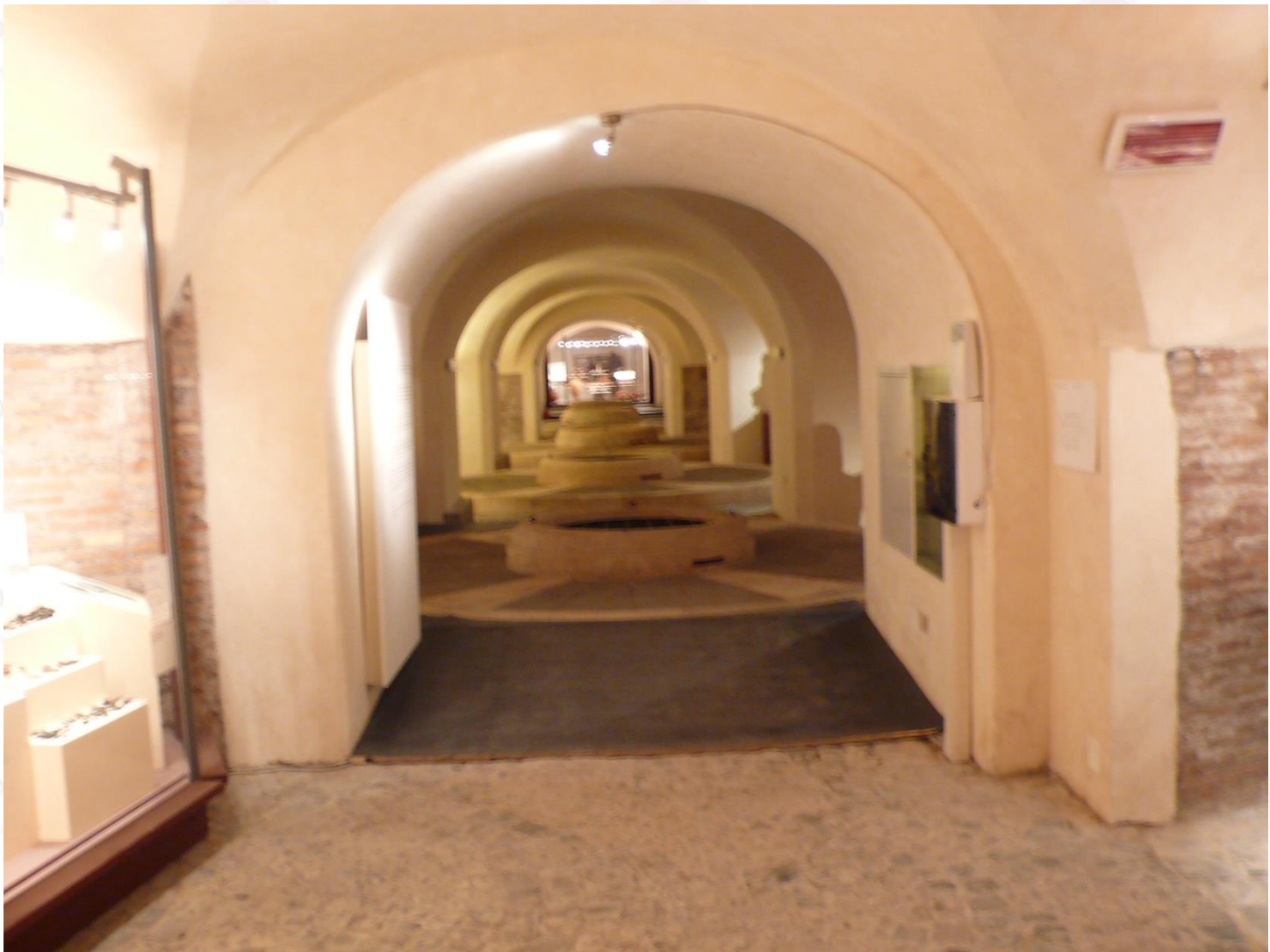
The principal way of ancient olearie. (CB 2009).