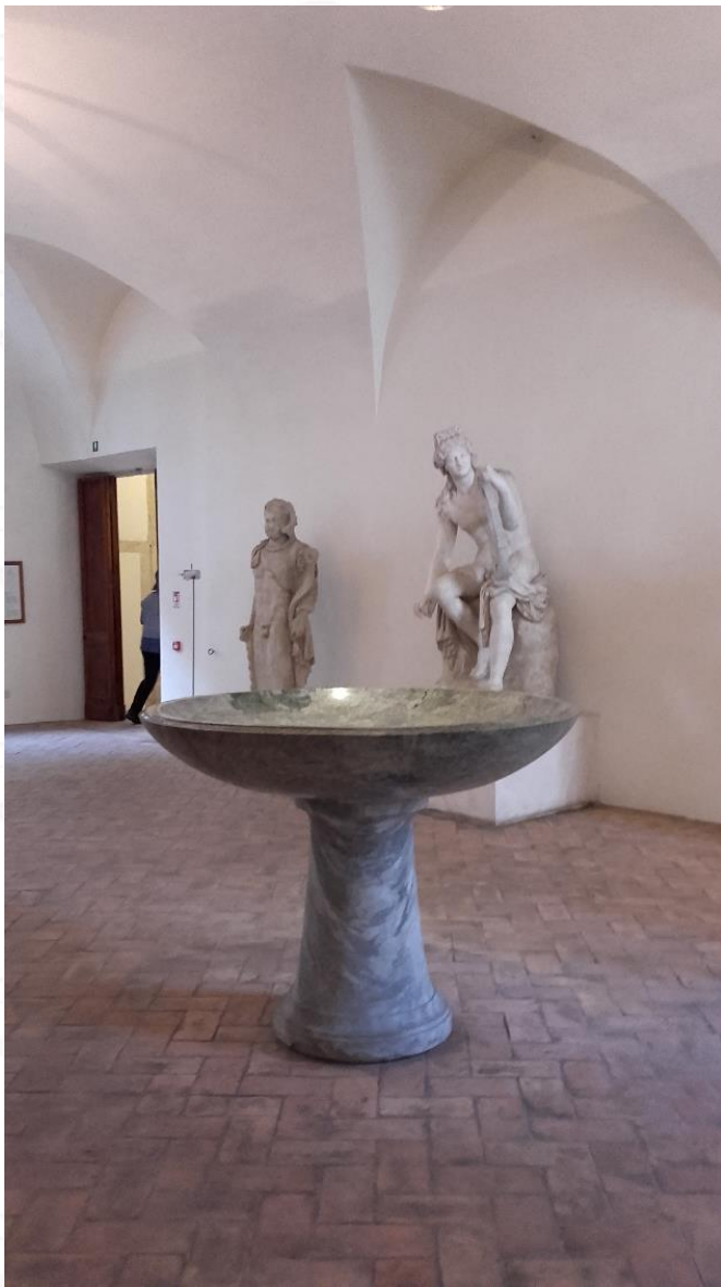
Rome, Palazzo Altemps, ground floor with the authentic renaissance pavement. (CB 2012).