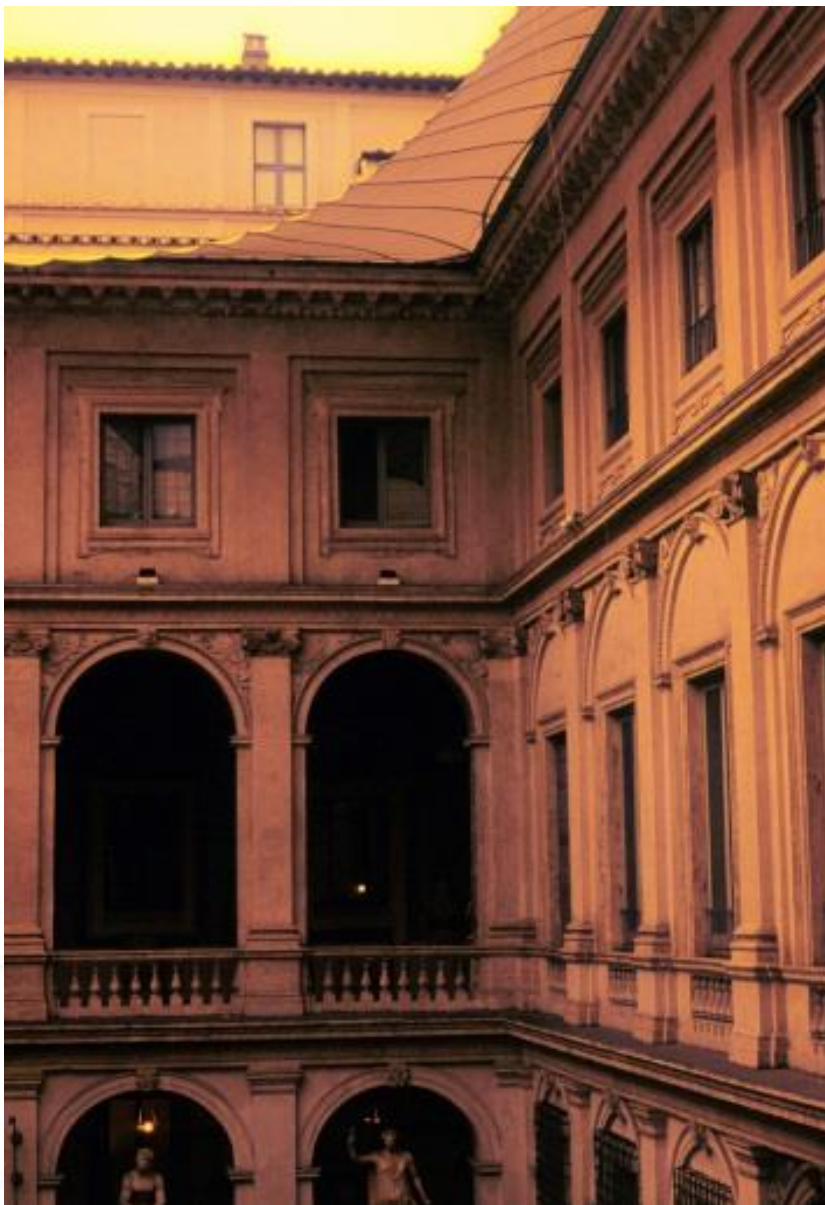
Rome, Palazzo Altemps, view of the courtyard. (CB 2012).