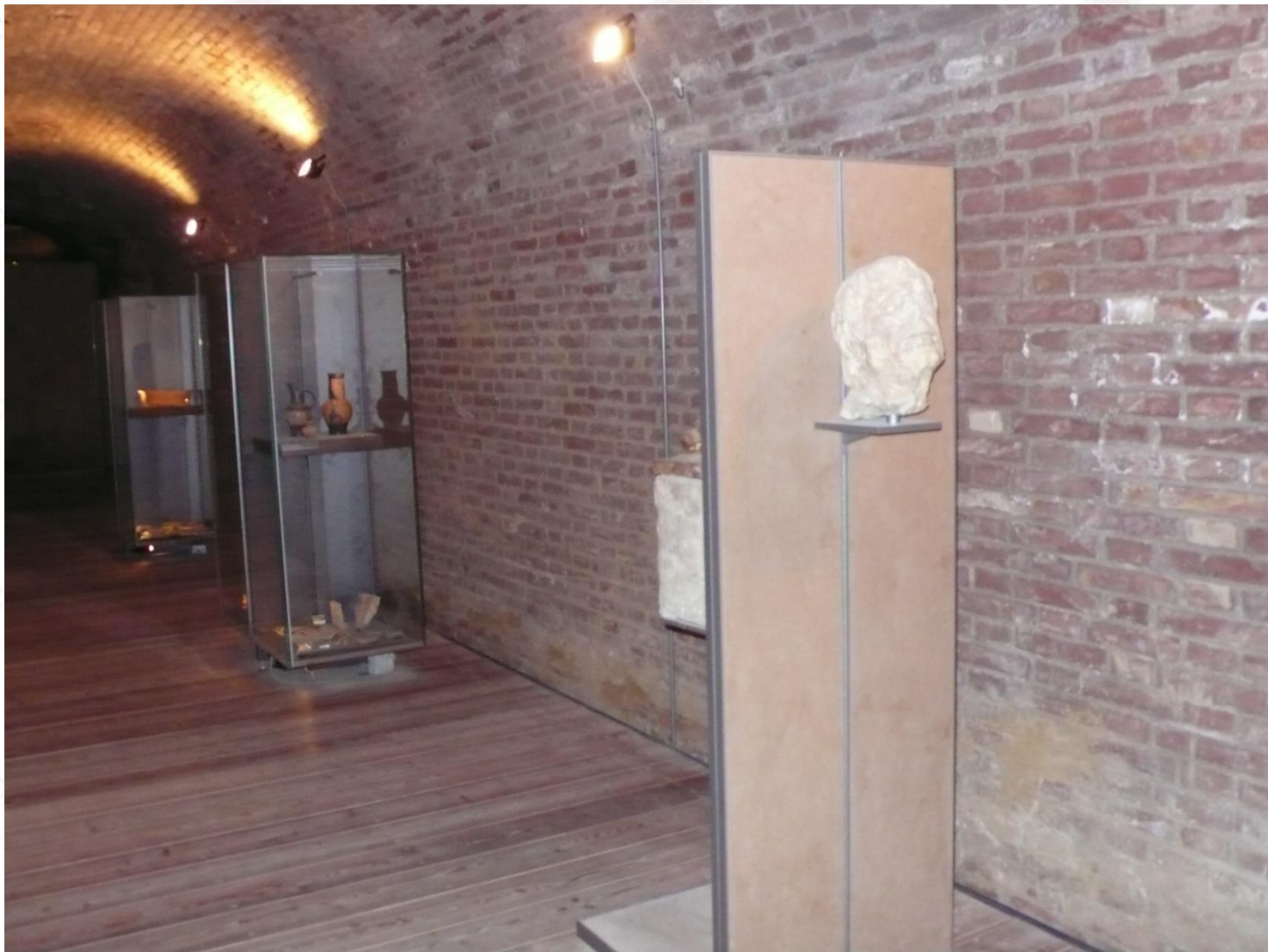
Archaeological level, different support. (CB 2012).