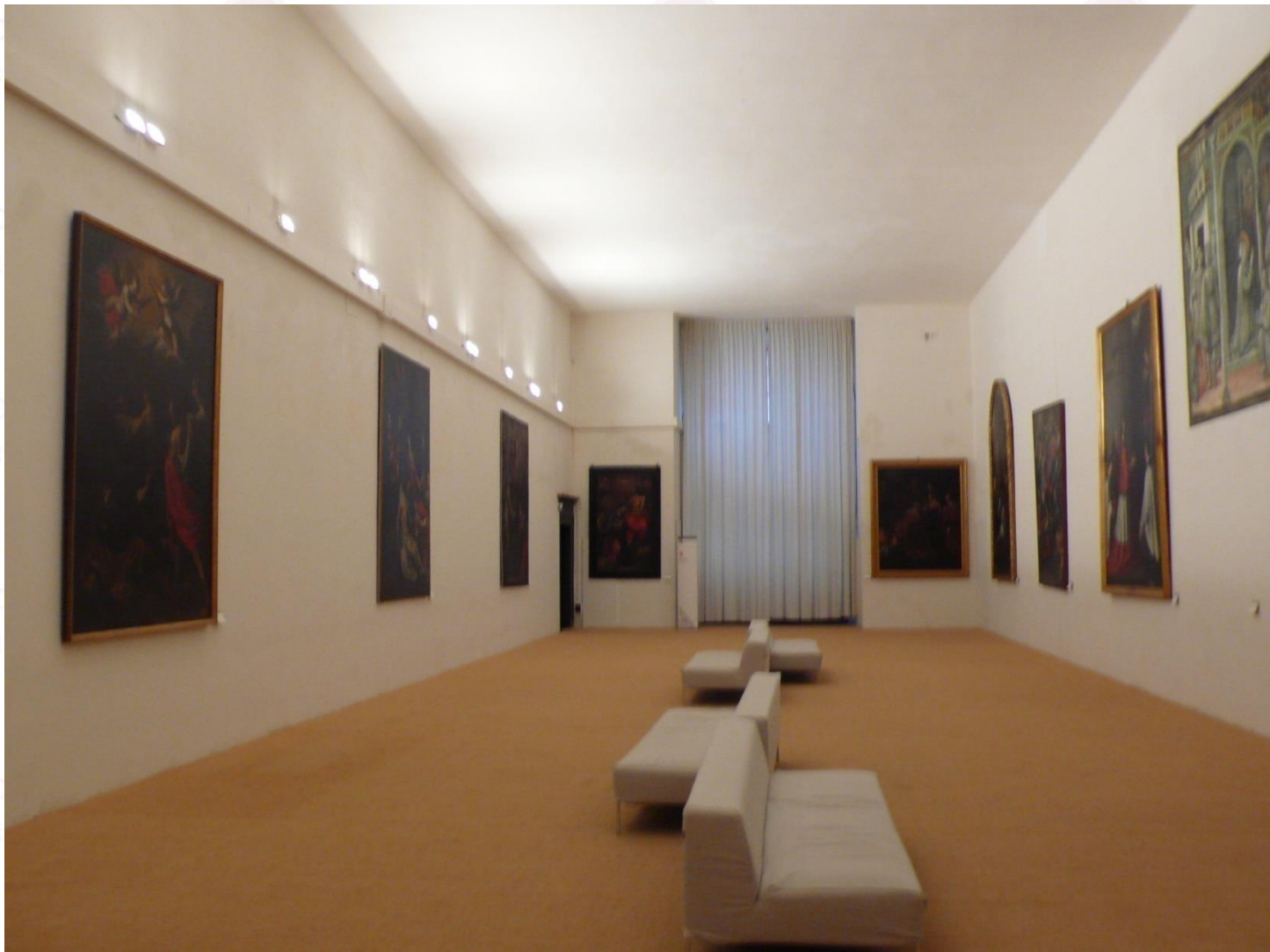
The lighting project for the exhibitions (CB 2012).