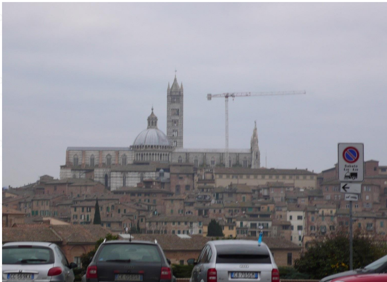
Siena, view of the Cathedral and nearest hospital St. Maria della Scala. (CB 2016).