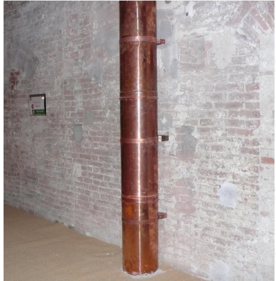
Details of correct insertion of new floor with reversible material. (CB 2012).