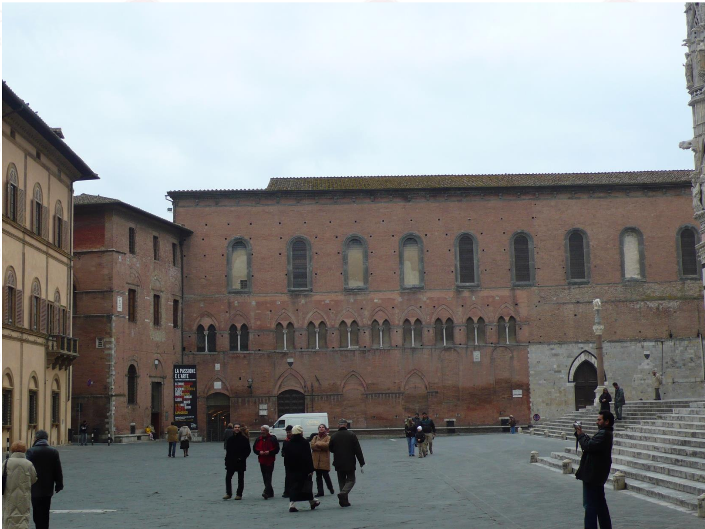
Siena, St. Maria della Scala, from ancient hospital to historical Museum for the city - Architect Guido Canali (CB 2016).