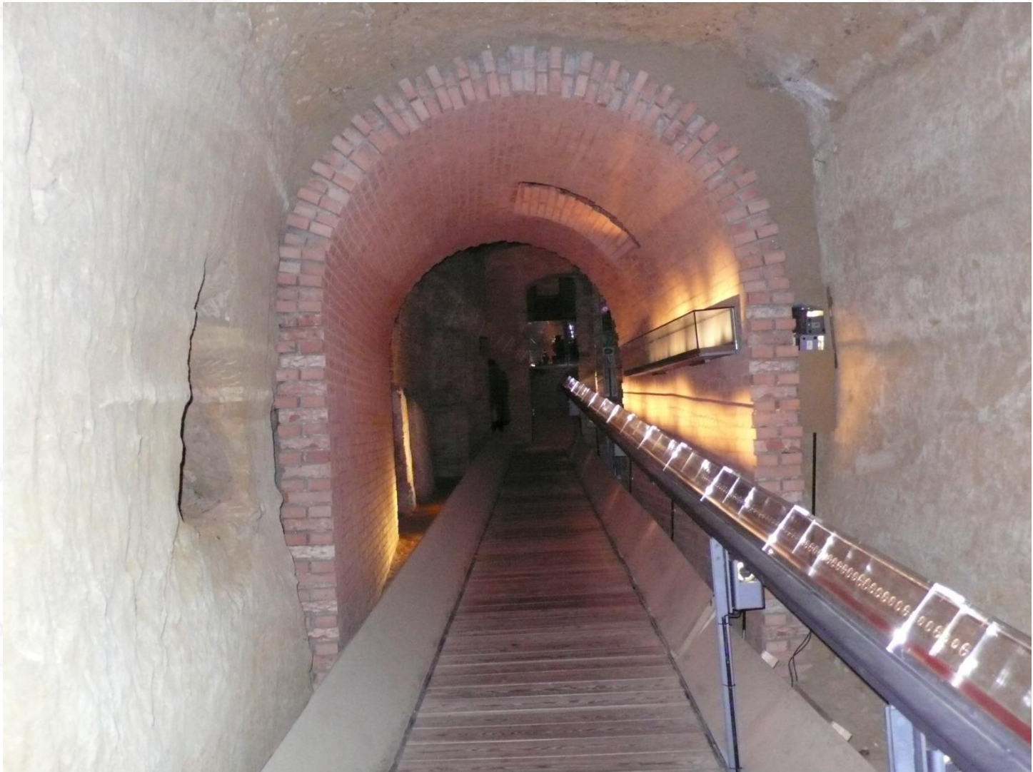
Archaeological level, walkway with different light sources (CB 2012).