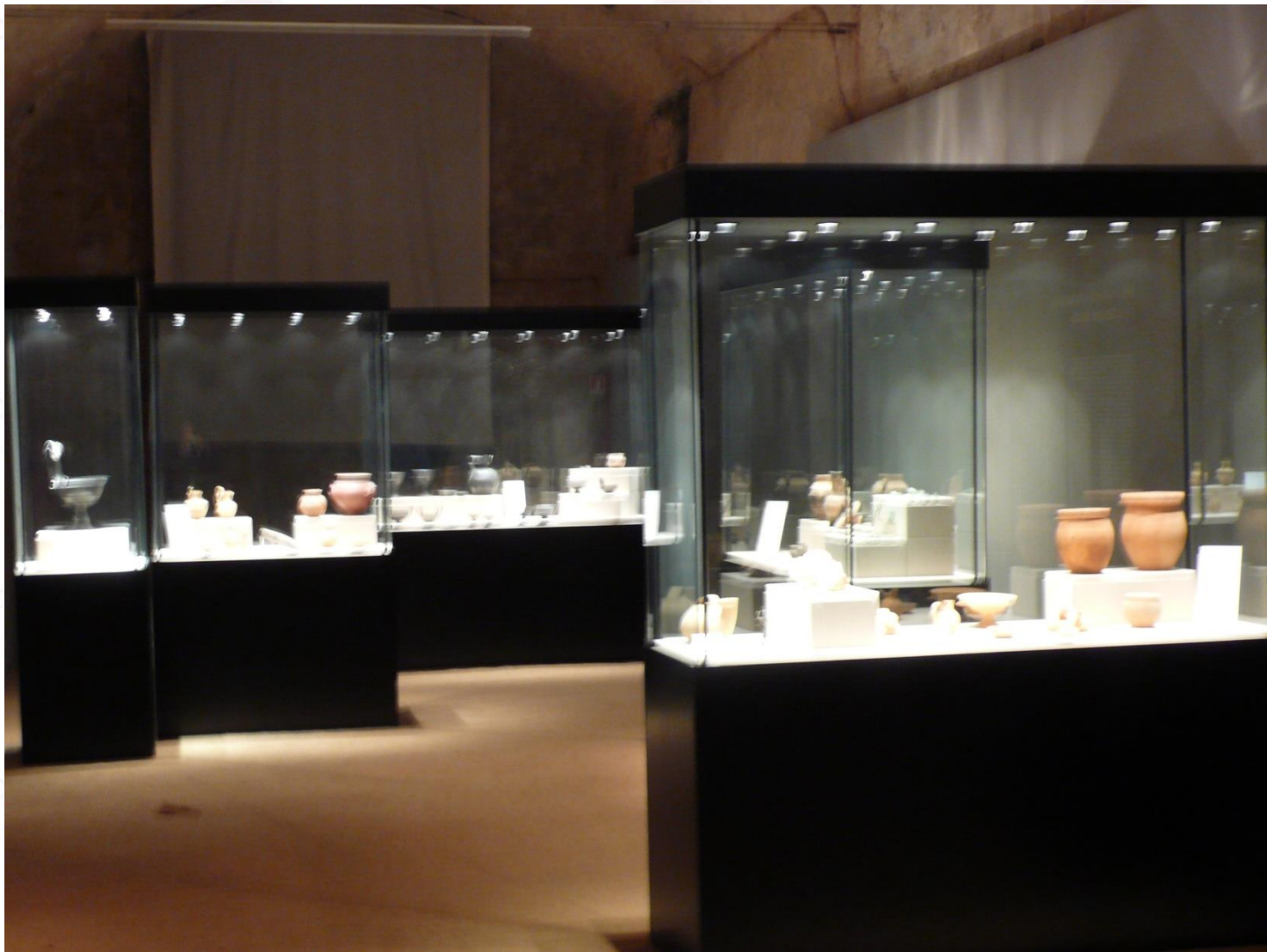
Show-cases (CB 2012).