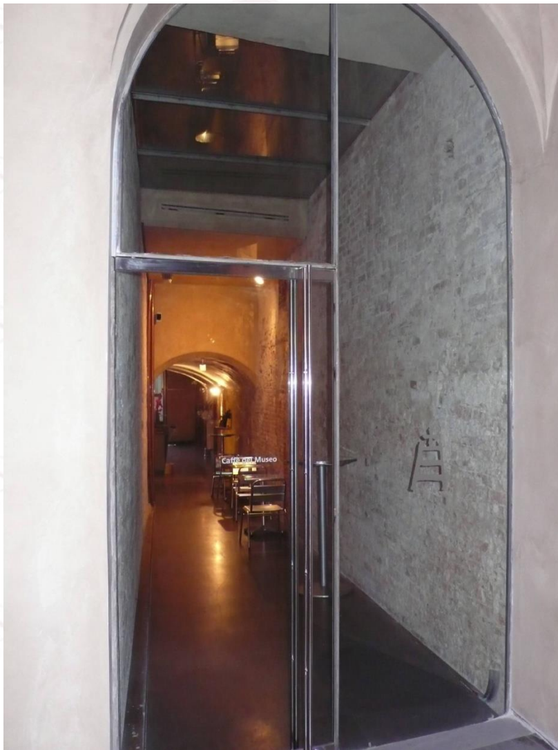
The insertion of the glass-door for a different section of Museum (CB 2012).