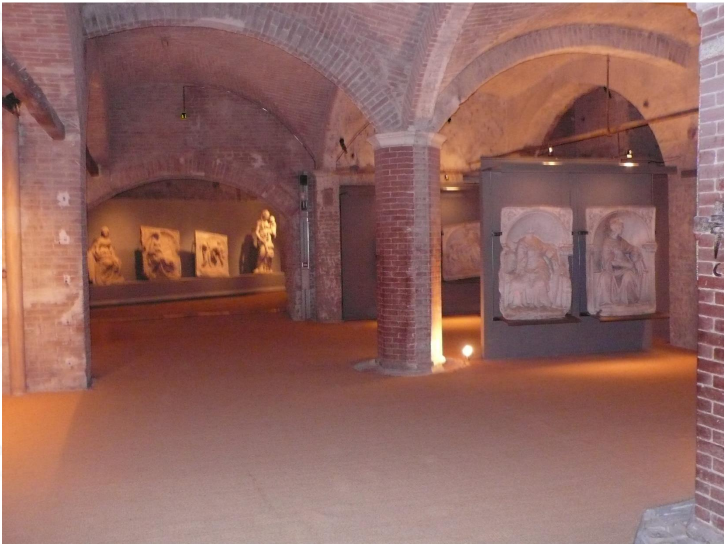
Ancient barn for a new museum. The authentic fragments of Fonte Gaia (CB 2012).