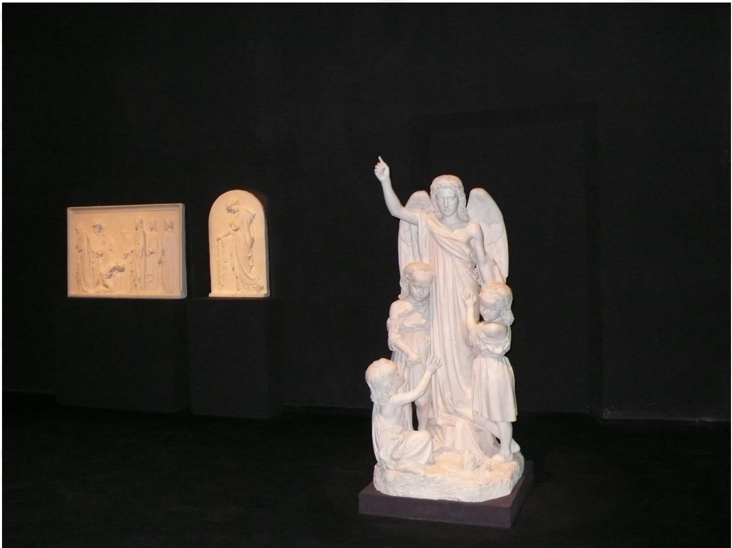
A correct perception of the sculptures with a right lighting (CB 2012).