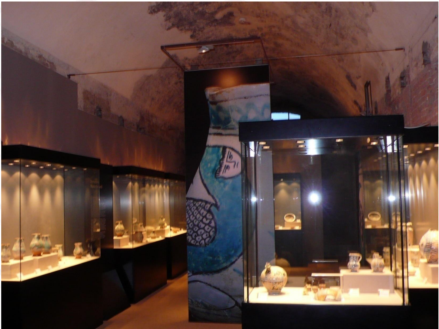
Insertion of contemporary art with ancient fragments (CB 2012).