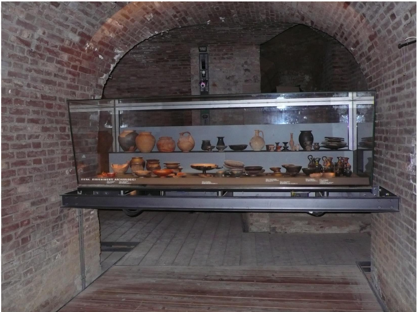
Archaeological level detail of show-cases with etruscan fragments. (CB 2012).