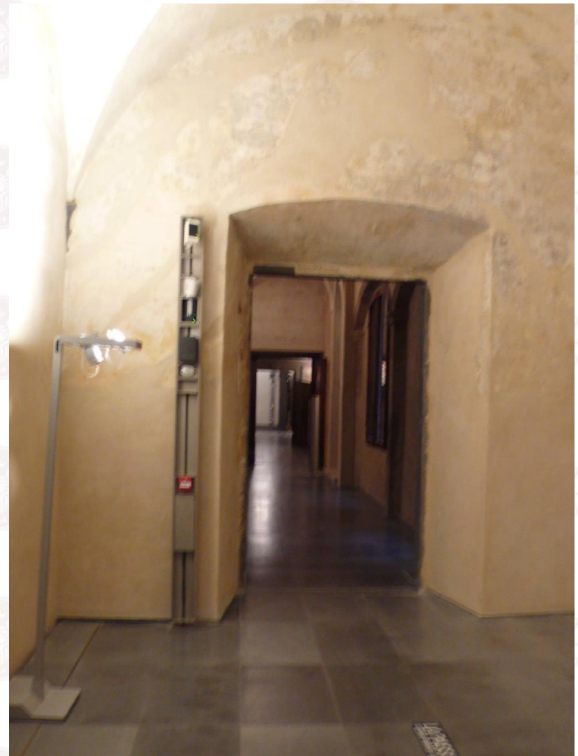
Technical installation (CB 2012).