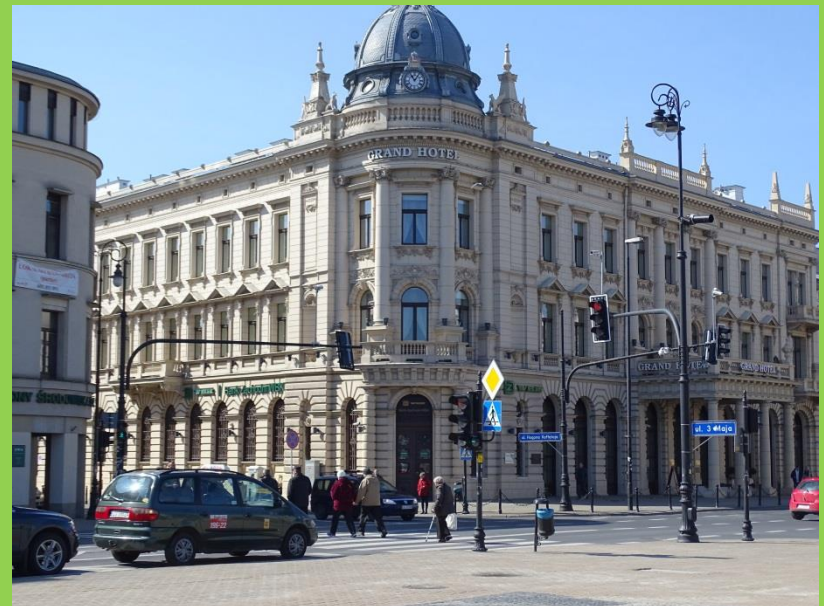
Litewski Square: before