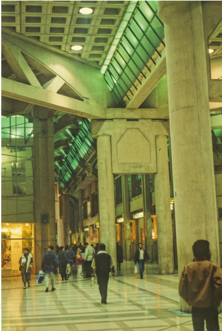
“Les Chatellet” metro station and commercial underground area. (CB 1988)