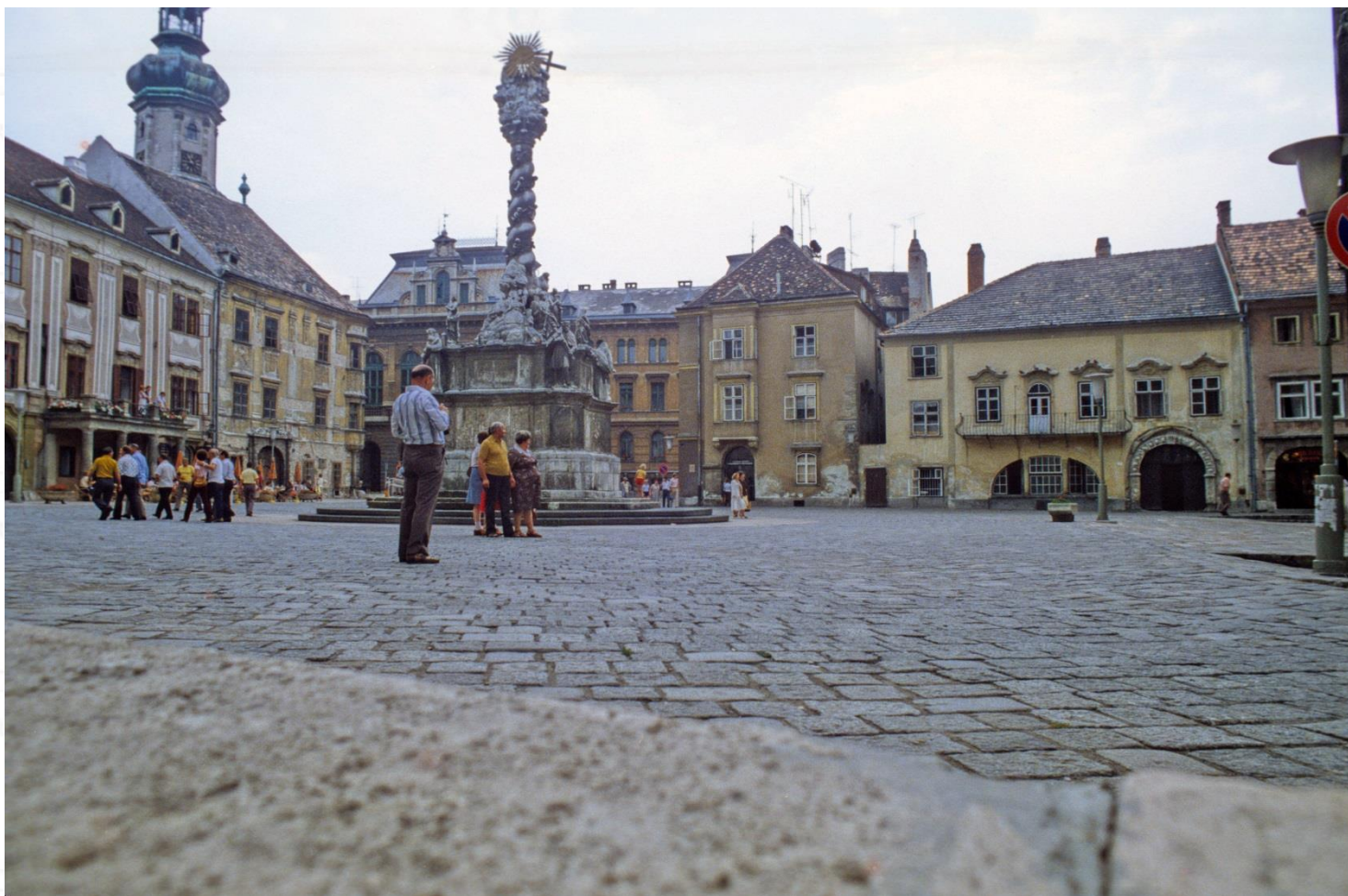
Conservation area

I - THEORY AND HISTORY OF CONSERVATION L 13 Misunderstanding in Terminology: «reuse», rehabilitation, renovation, recovery, reanimation, recycling... DECLARATION OF AMSTERDAM 1975