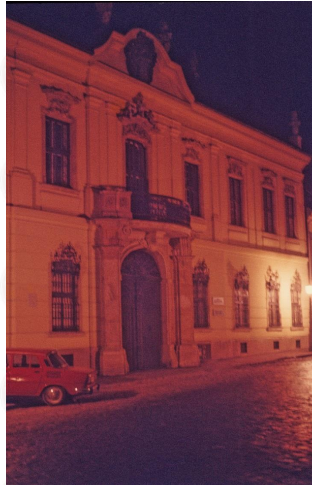
Historic center, restoration of an historical building for residence and offices. (CB 1989 leftside and 1994 rightside)