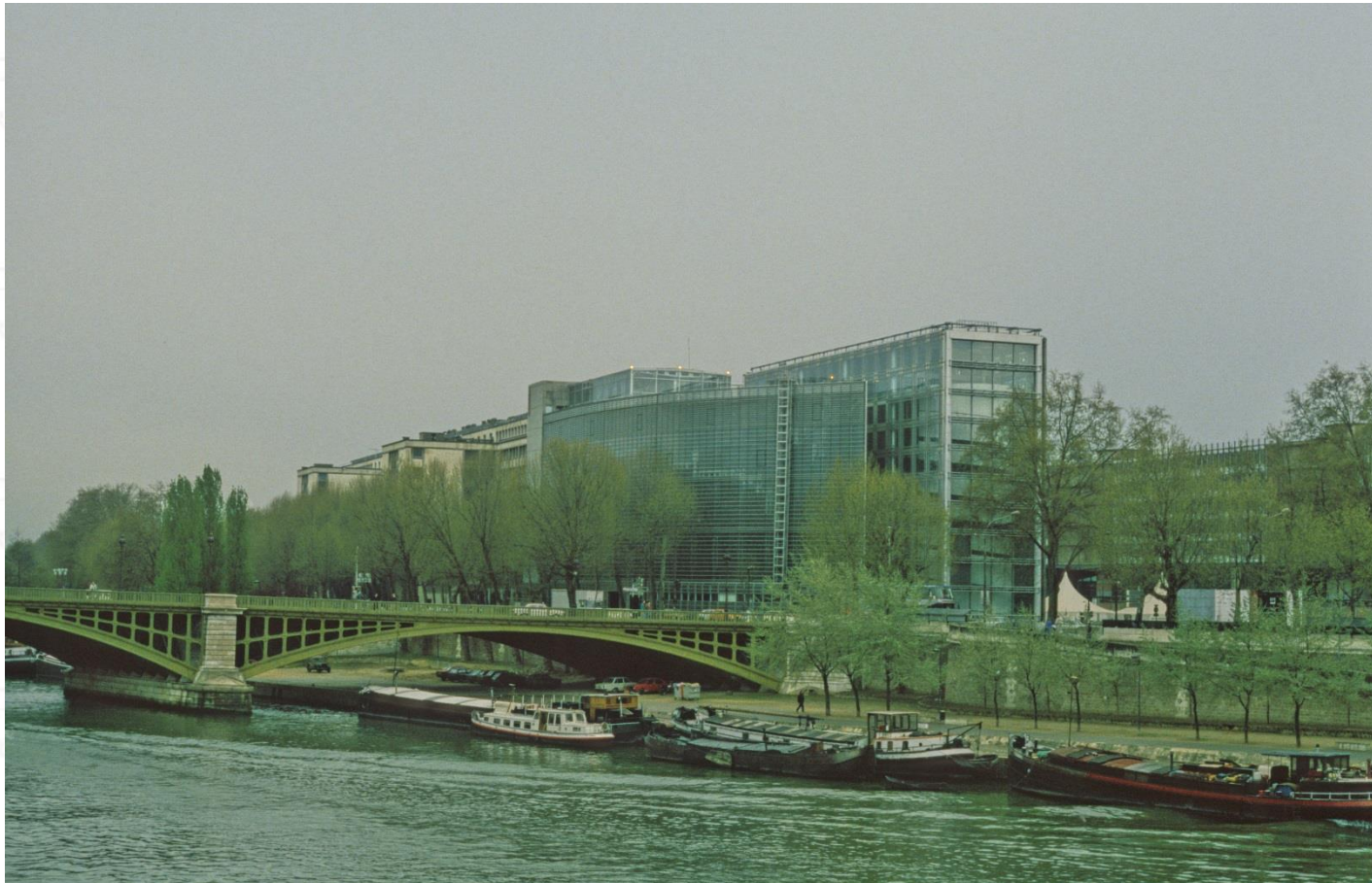
Institute of Islamic Center, Jean Nouvel. (CB 1987)