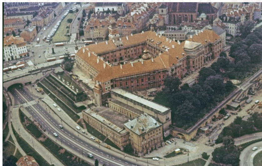
Royal Castle reconstruction and museum