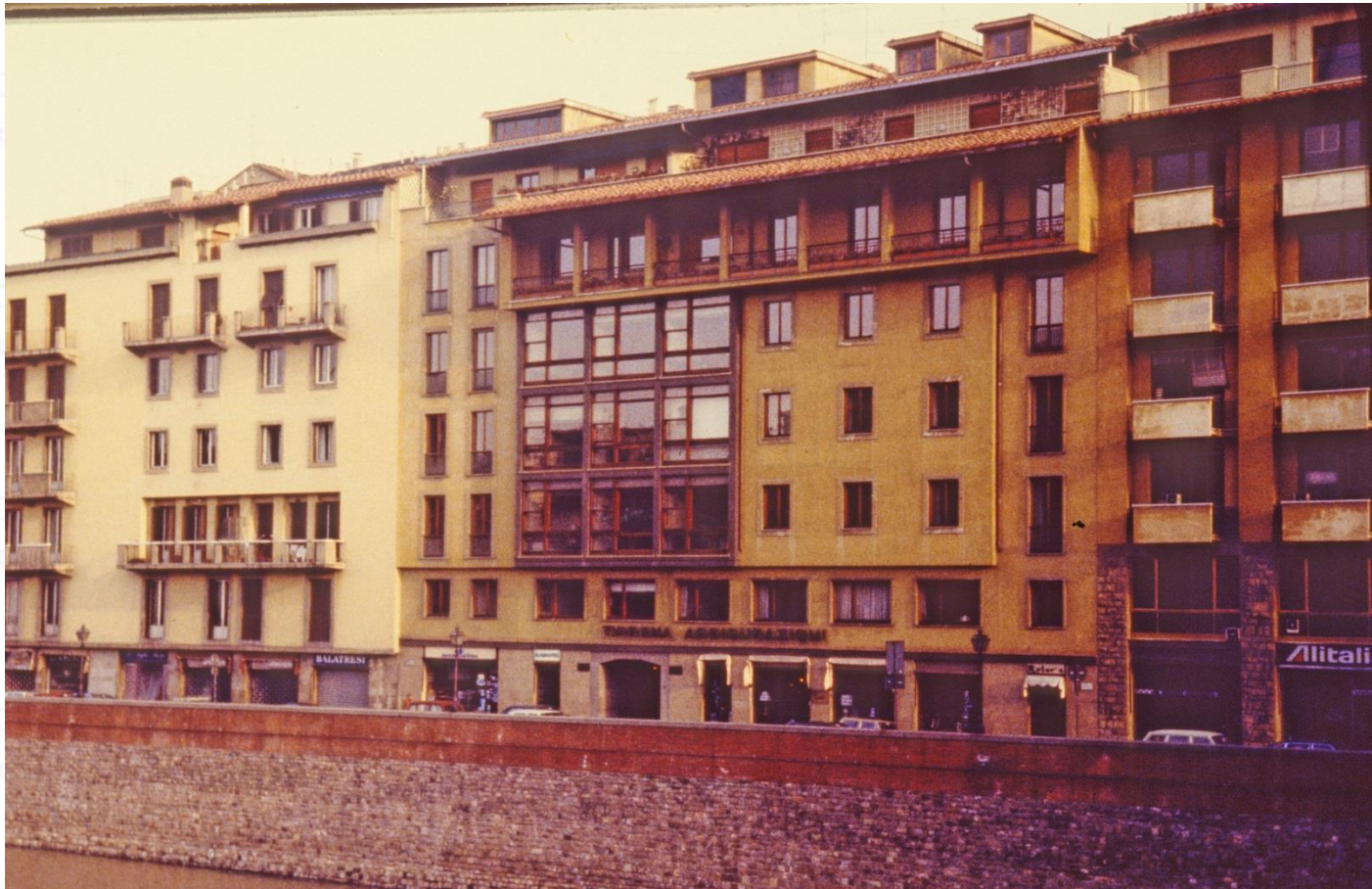
Reintegration of lost and housing in Lungarno. (CB 1988)