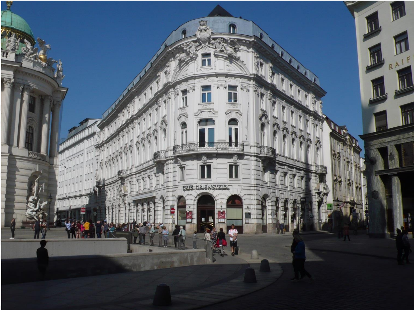
Michaelerplatz and kohlmarkt. The pedestrian area with archaeological excavation.

I - THEORY AND HISTORY OF CONSERVATION L 13 Misunderstanding in Terminology: «reuse», rehabilitation, renovation, recovery, reanimation, recycling... DECLARATION OF AMSTERDAM 1975