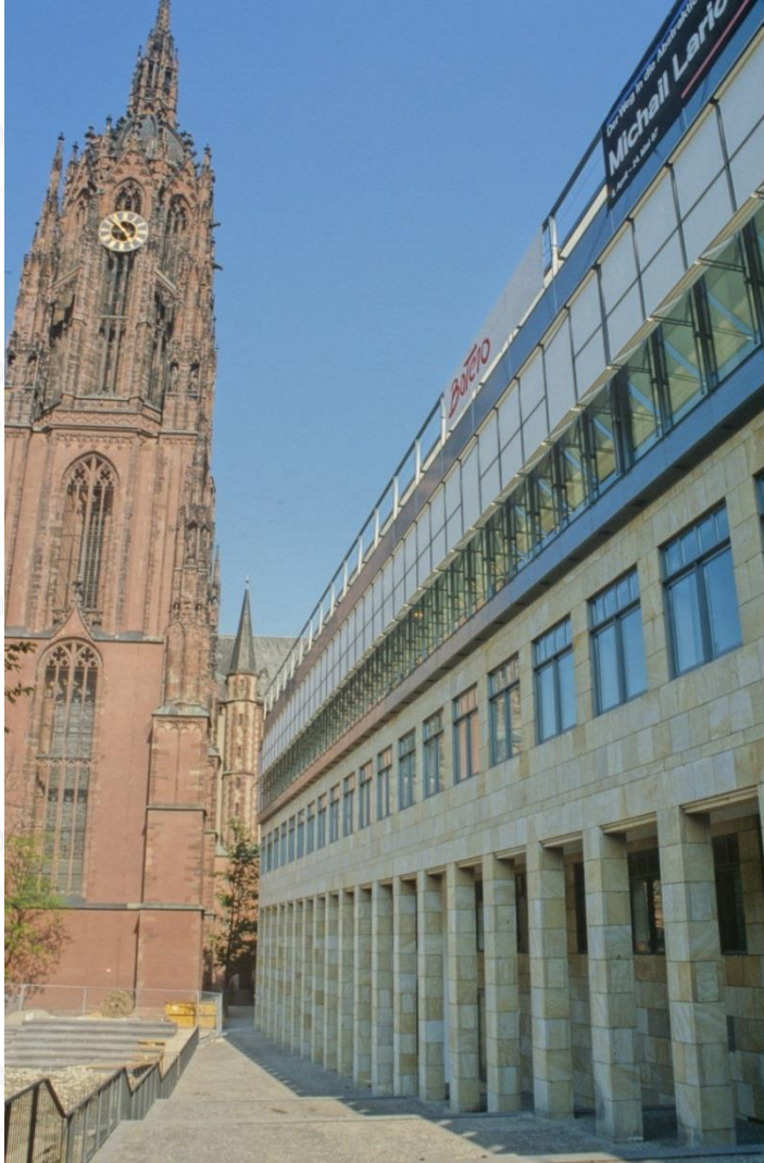
New insertion for cultural space: museum (CB 1992)