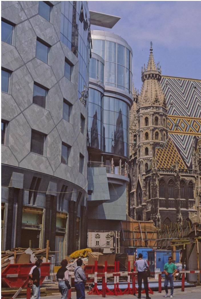
Stephan platz, the dome and the commercial area with “Haas Haus” of Hans Hollein