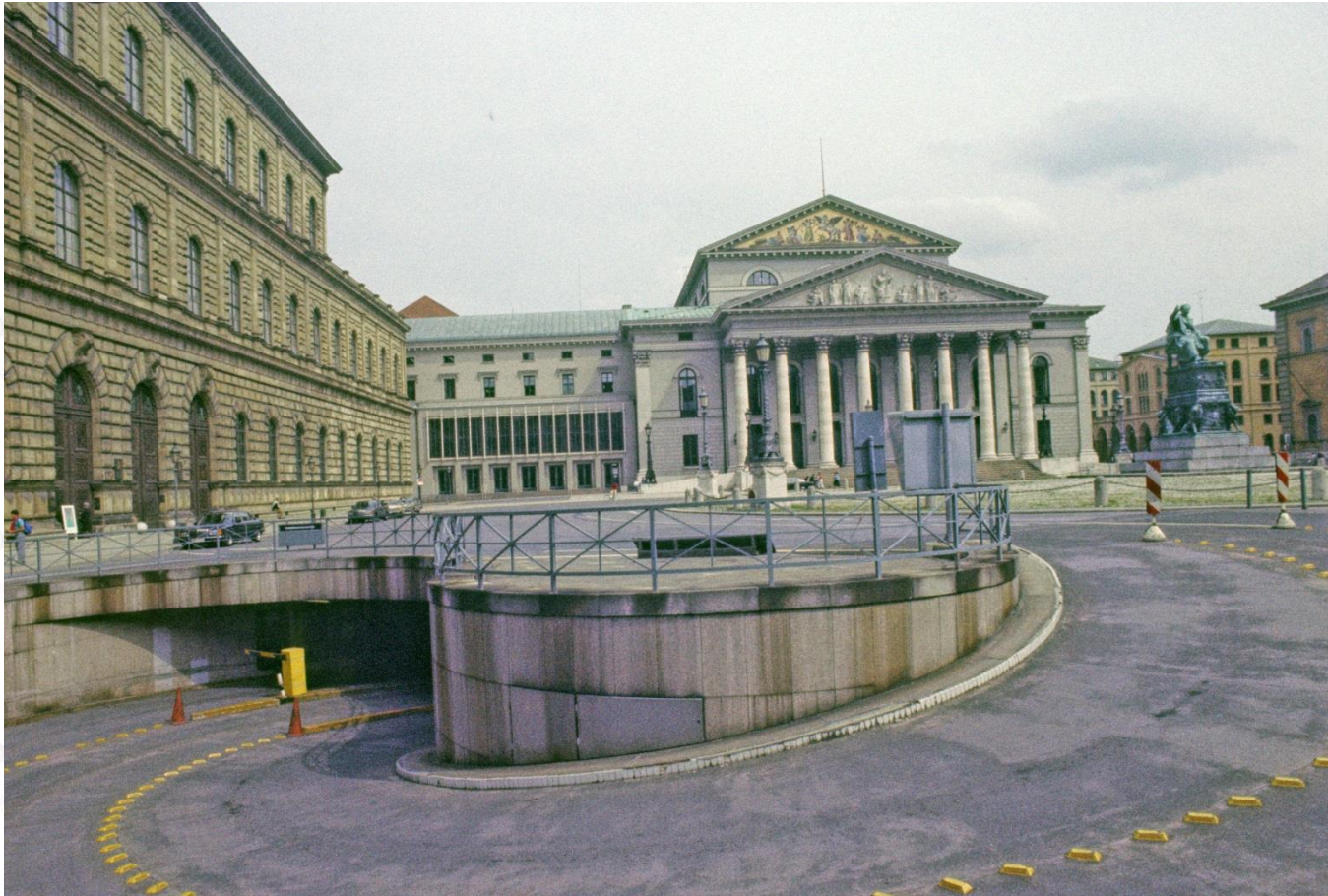
The pedestrian area and underground car park. (CB 1989)