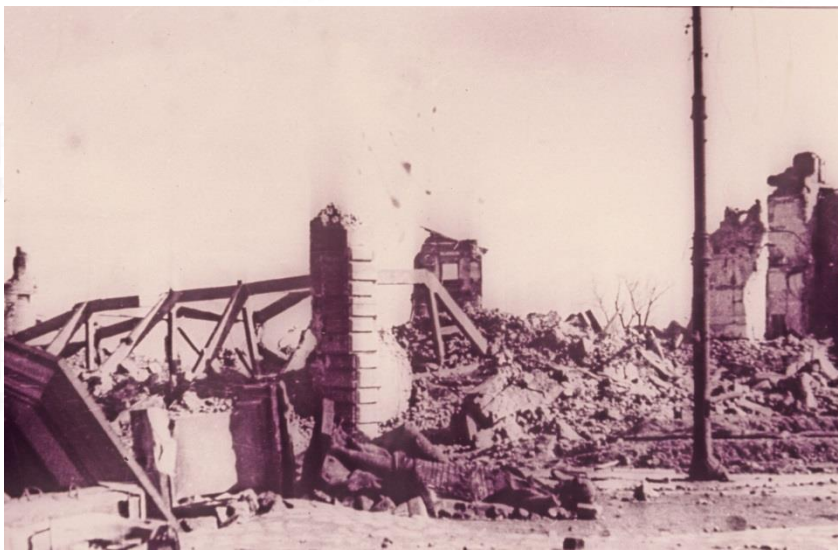
Royal Castle destroyed during the Second World War