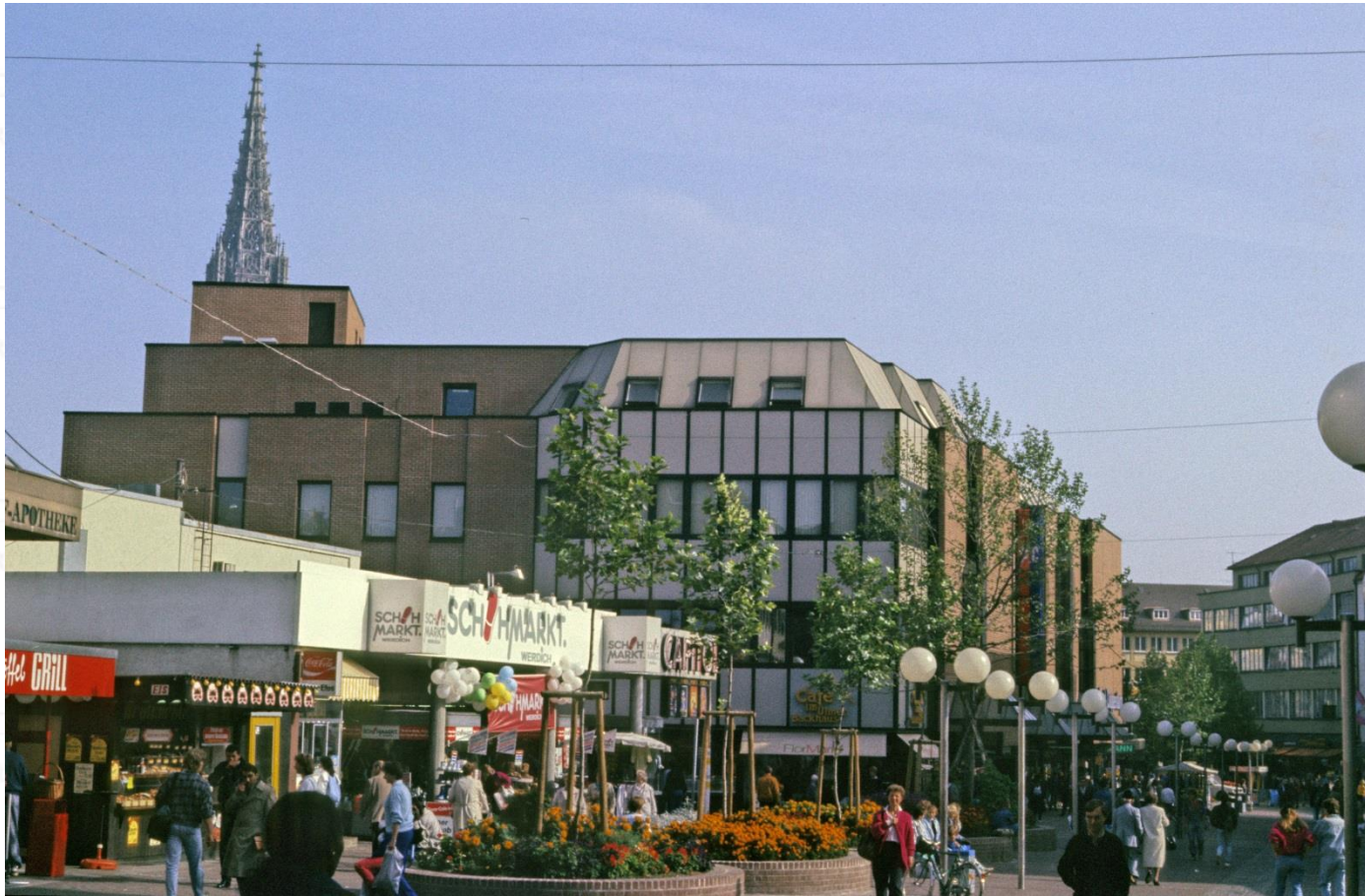
New building in the historic area after the reconstruction period. (CB 1986)