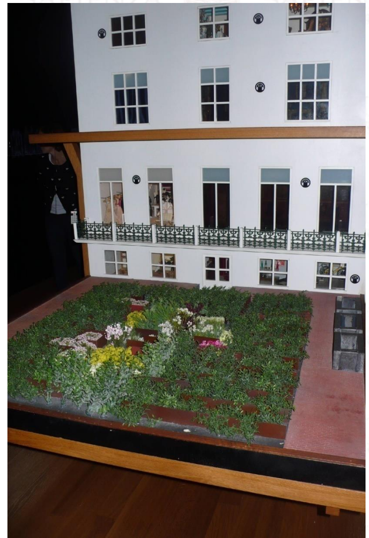
Drawing and maquette of two typical houses (CB 2016).