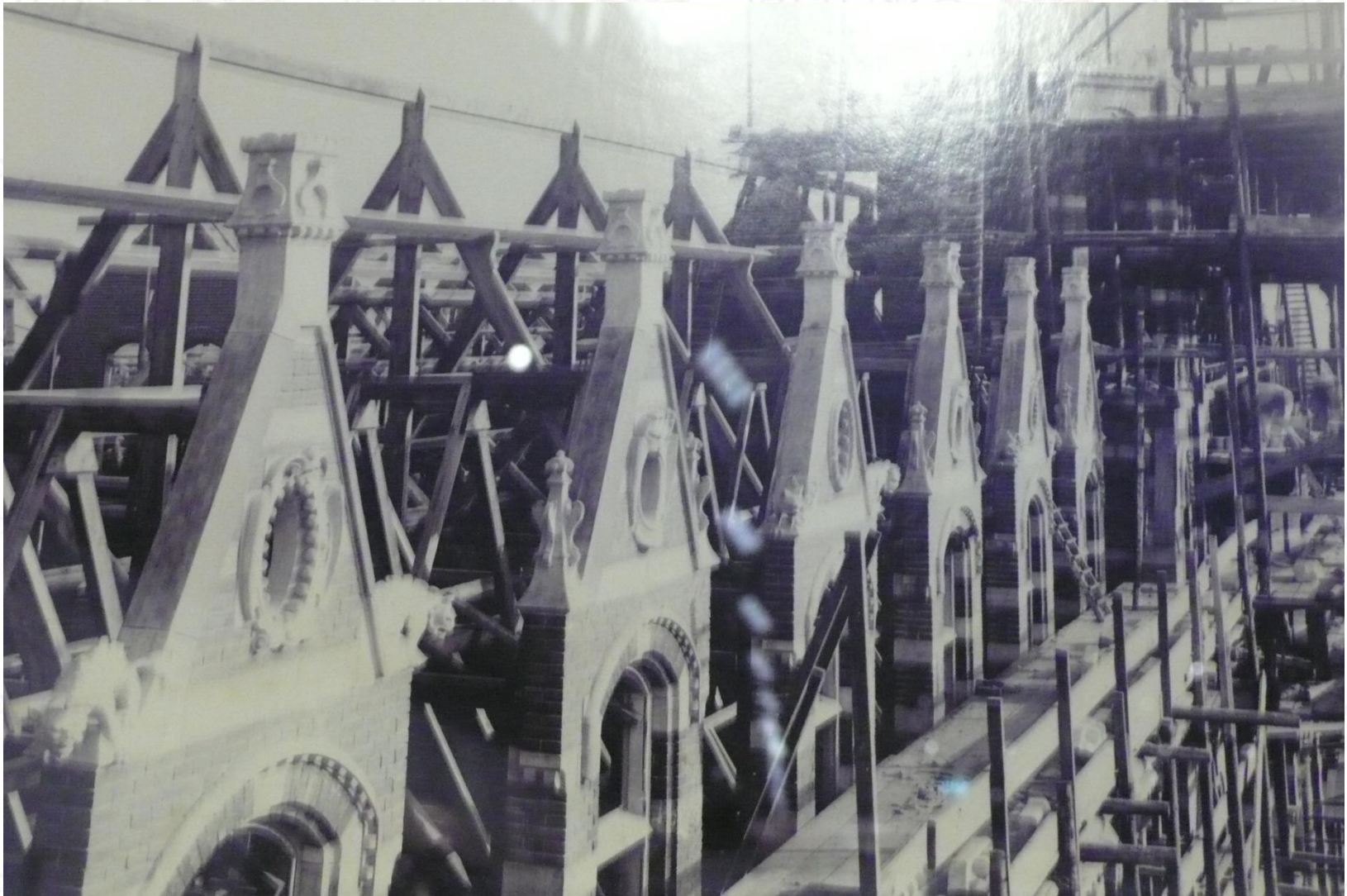
Ancient photo that shows the constructive techniques in Amsterdam (CB 2016).