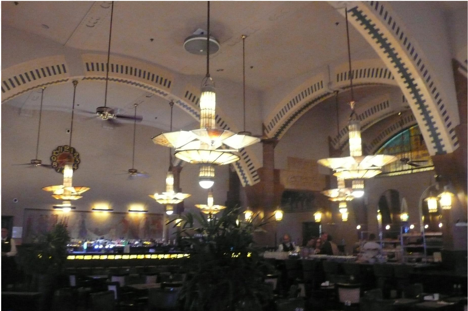
American Hotel, conservation of authentic Art Nouveau light (CB 2016).