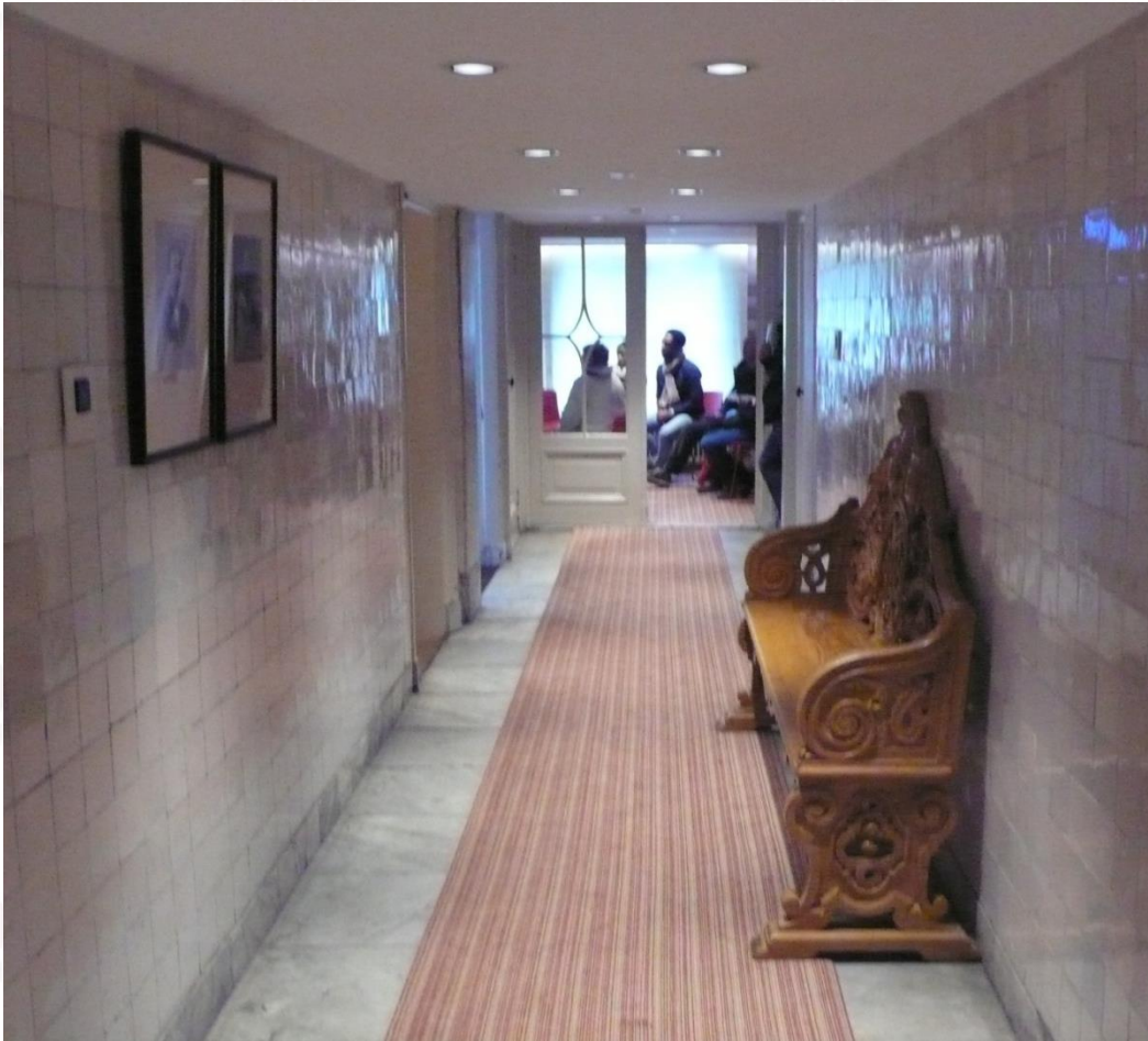
The access to the «house-museum» (CB 2016).