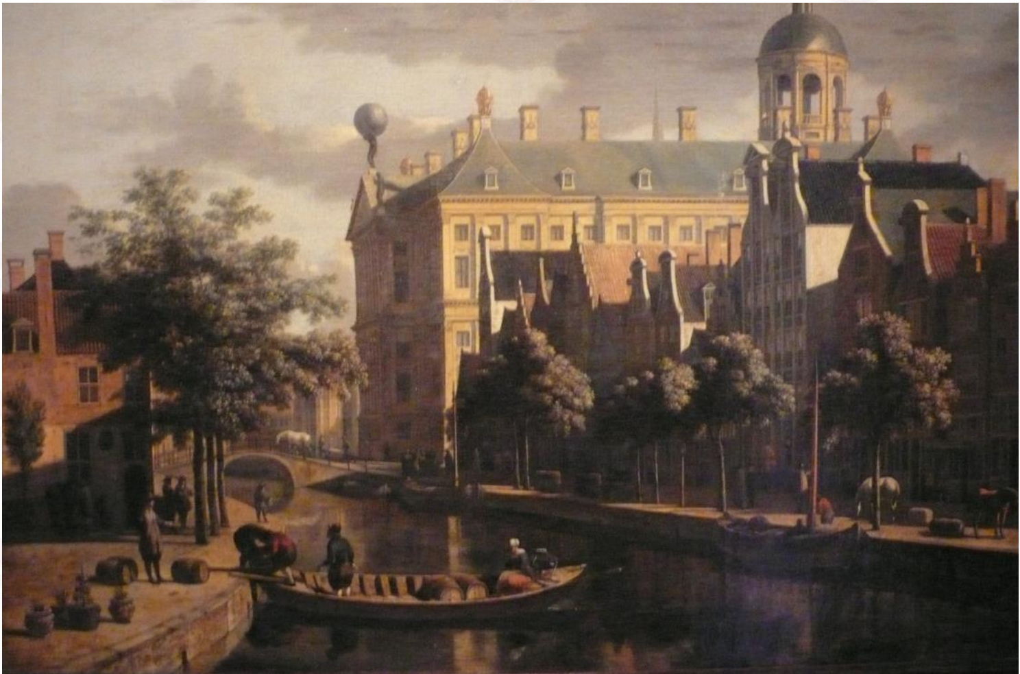
Historic views of the city and the channels. (CB 2016).