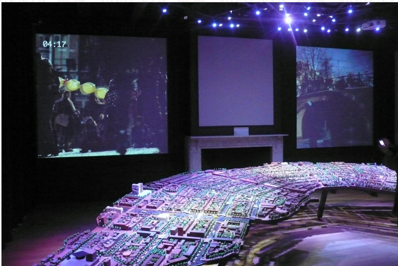
Maquette and video of different moments in Amsterdam (CB 2016).