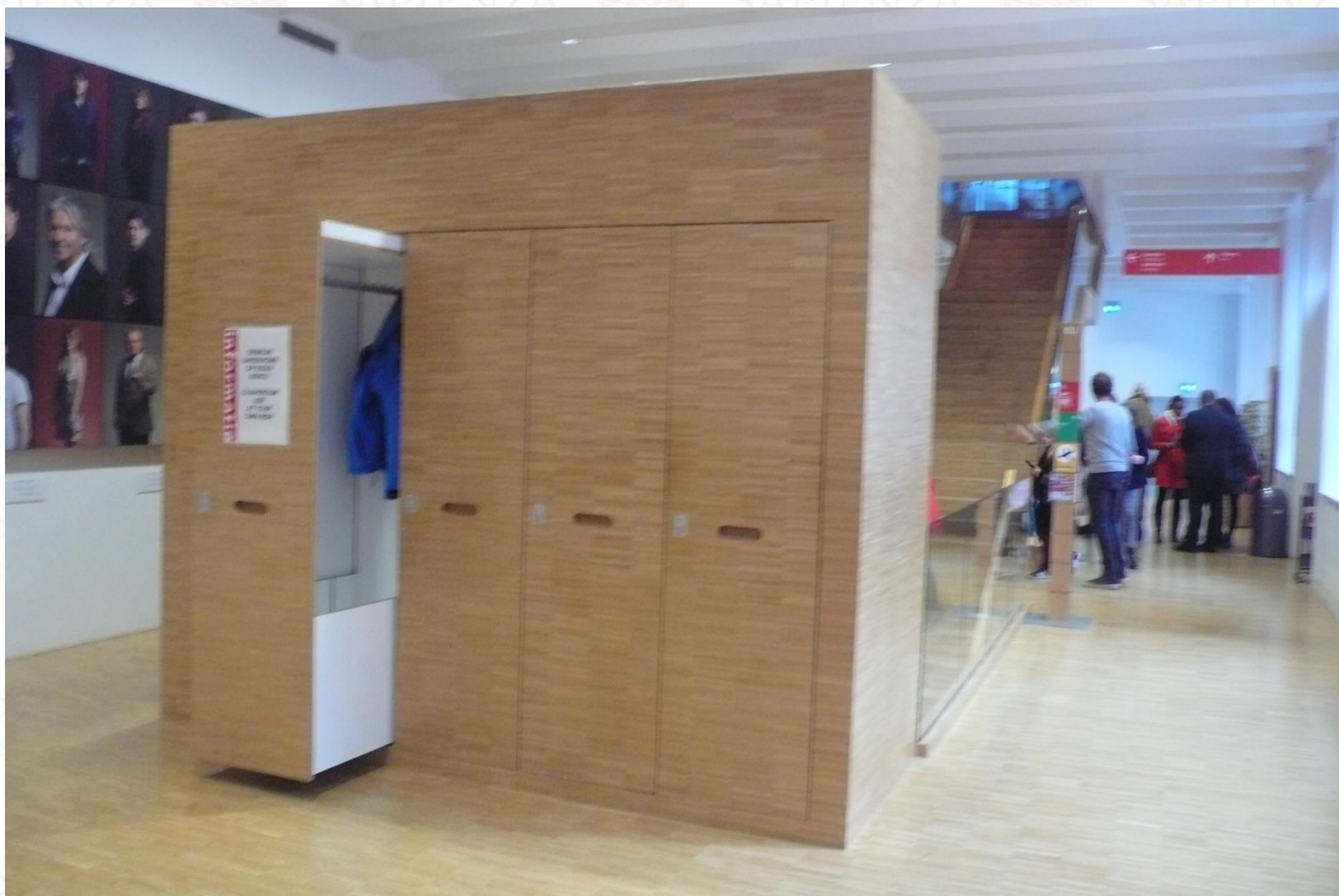
Reversible wooden boxes with services for the visitors (CB 2016).