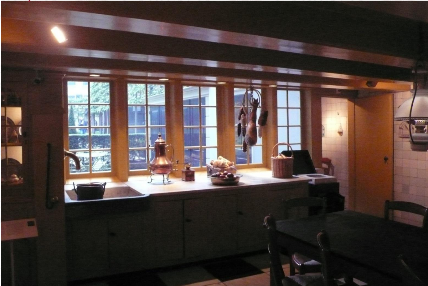
The kitchen (CB 2016).