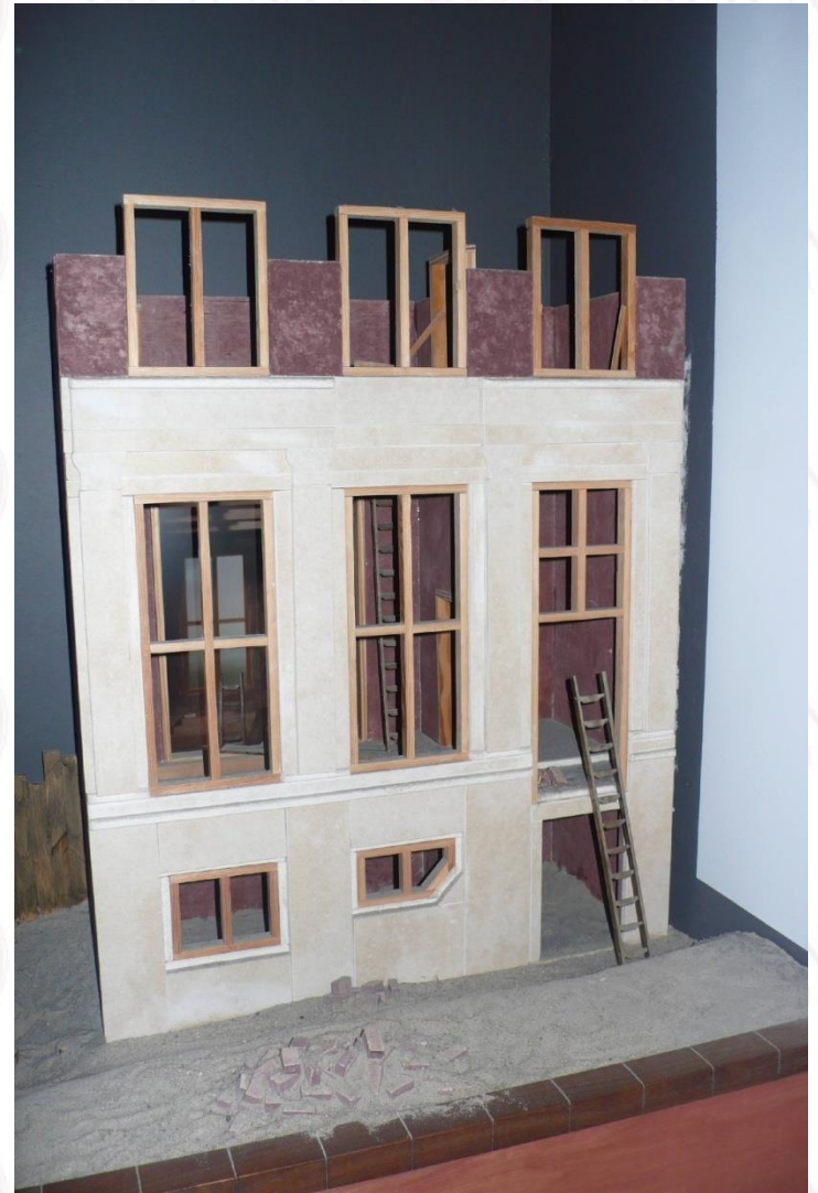
Constructive system for housing (CB 2016).