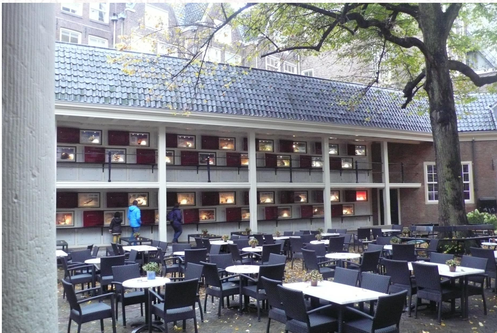
The courtyard adaptation (CB 2016).