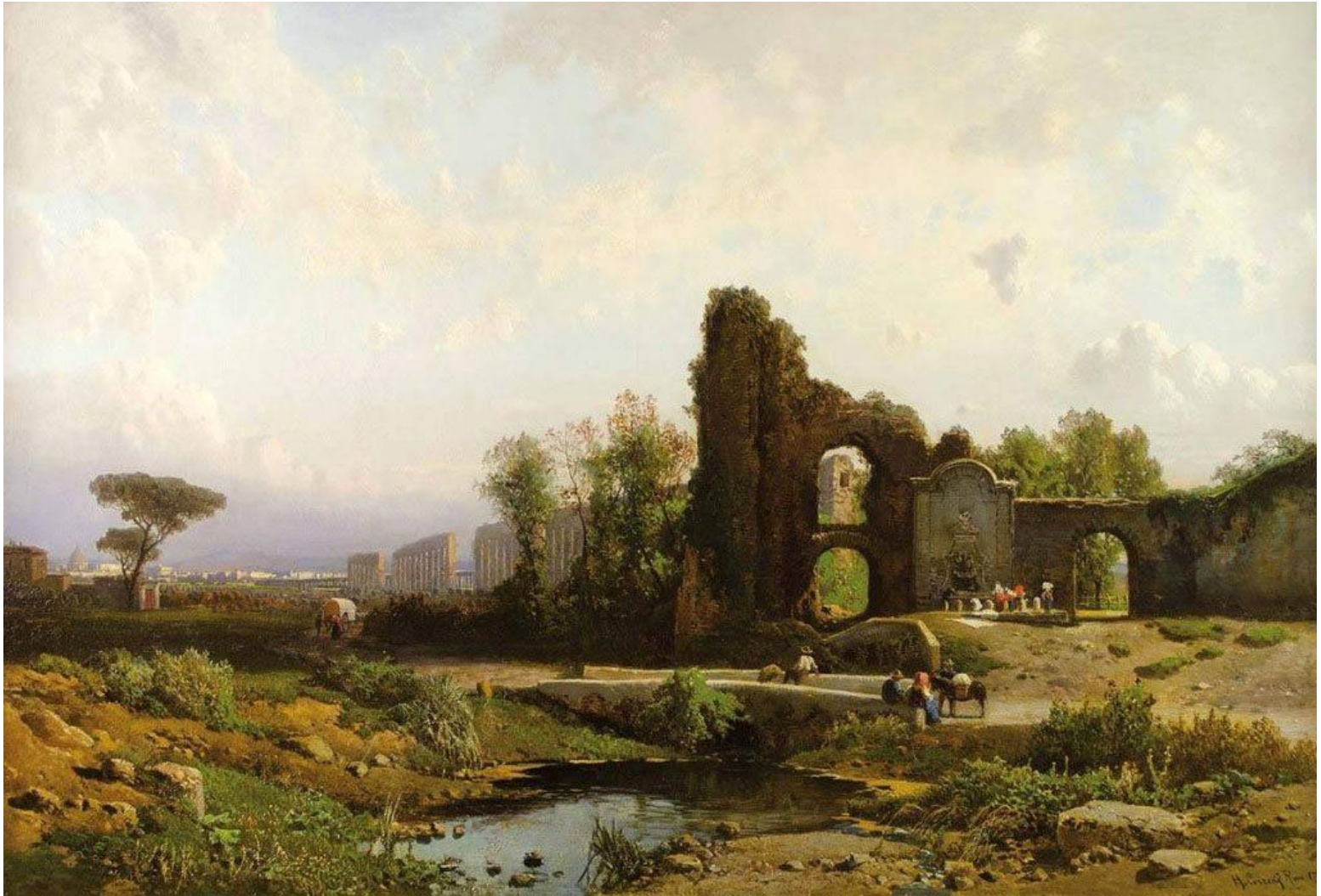
Hermann Corrodi, Sosta a Porta Furba