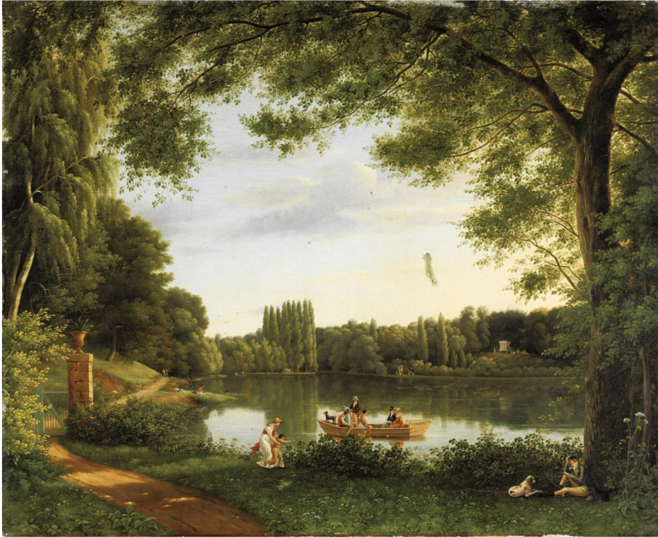
Jean-Joseph-Xavier Bidault, Vue du lac d'Ermenonville