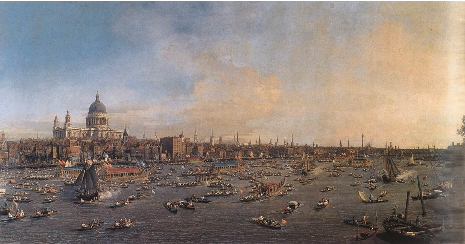
Giovanni Antonio Canal, The River Thames with St. Paul's Cathedral on Lord Mayor's Day