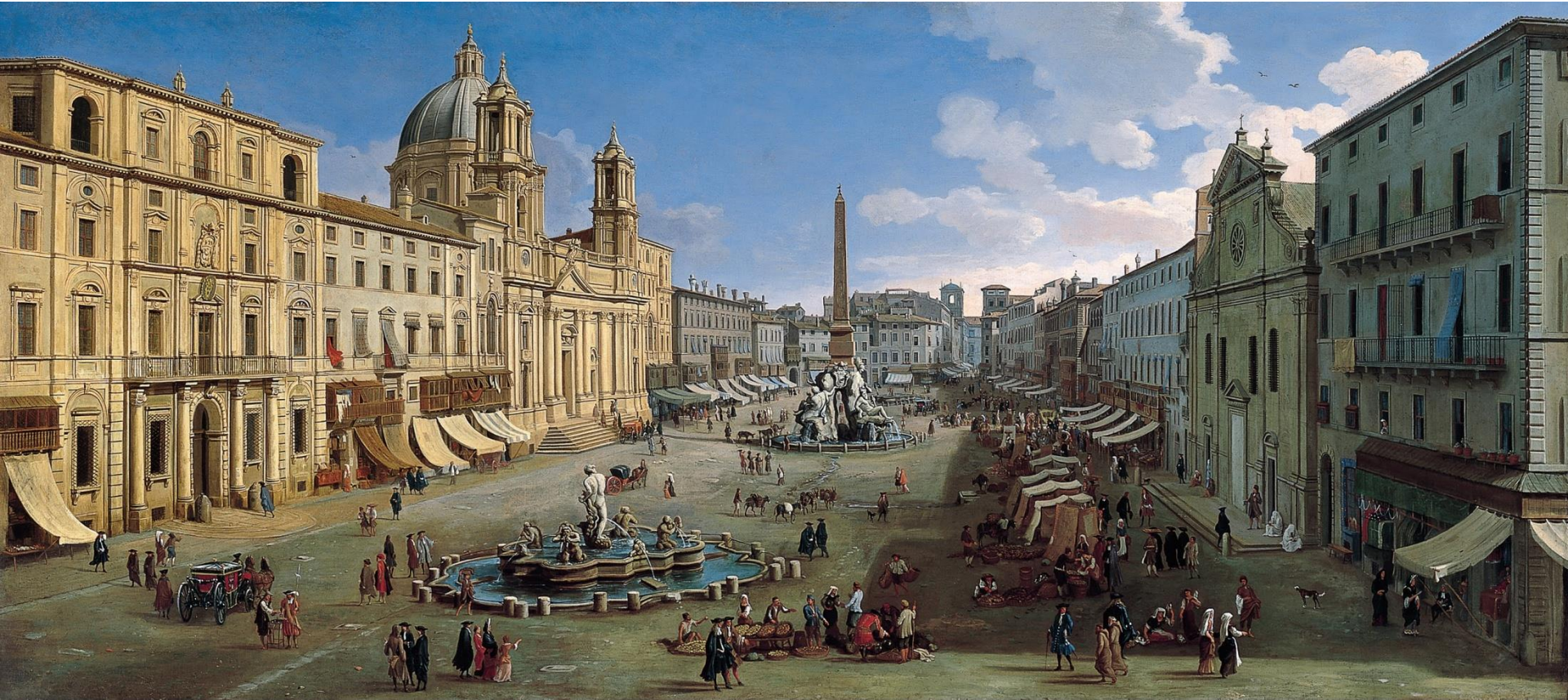
Caspar van Wittel Piazza Navona