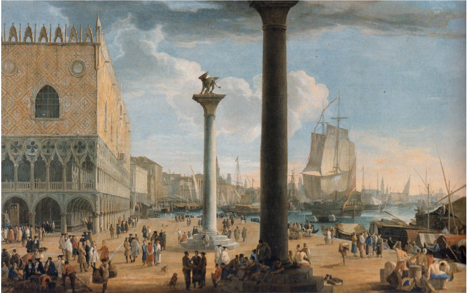
L. Carlevarijs, Il molo di San Marco verso la Basilica della Salute (detail)