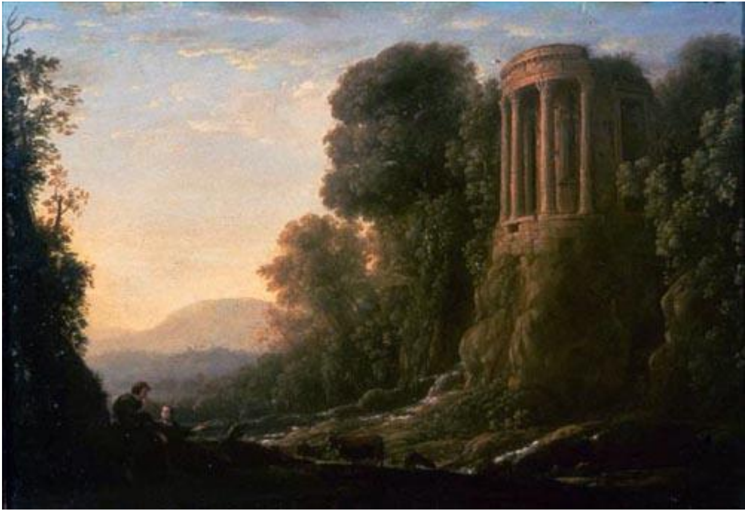
Claude Lorrain, River Landscape with the View of the Tiburtine Temple at Tivoli, c. 1635

Picturesque: current meaning – ATTRACTIVE AND INTERESTING, AND HAS NO UGLY MODERN BUILDINGS.