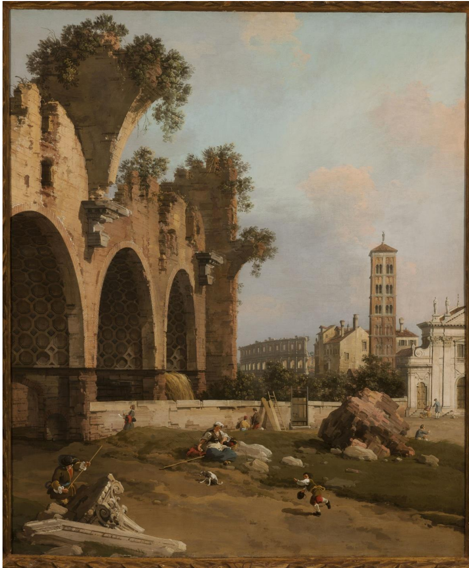
Roma, Canaletto, Museo di Roma, Collezione privata, courtesy of Matteo Salamon