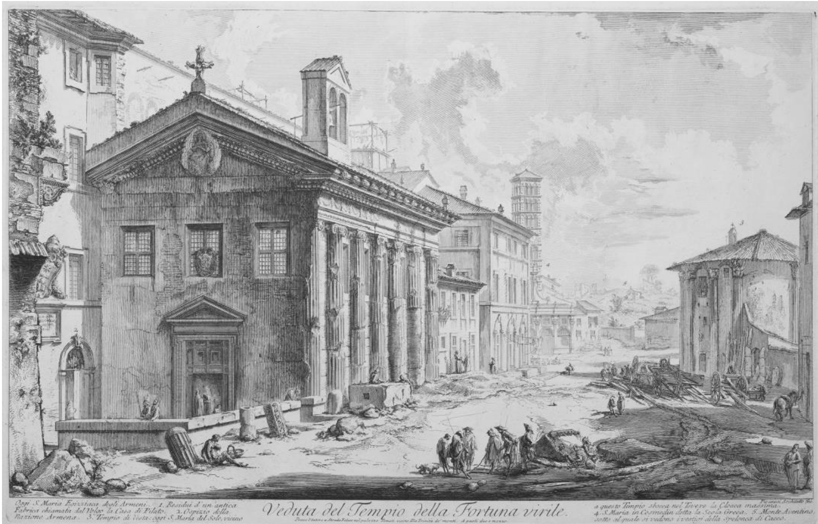
Giovan Battista Piranesi, Veduta del Tempio della Fortuna virile