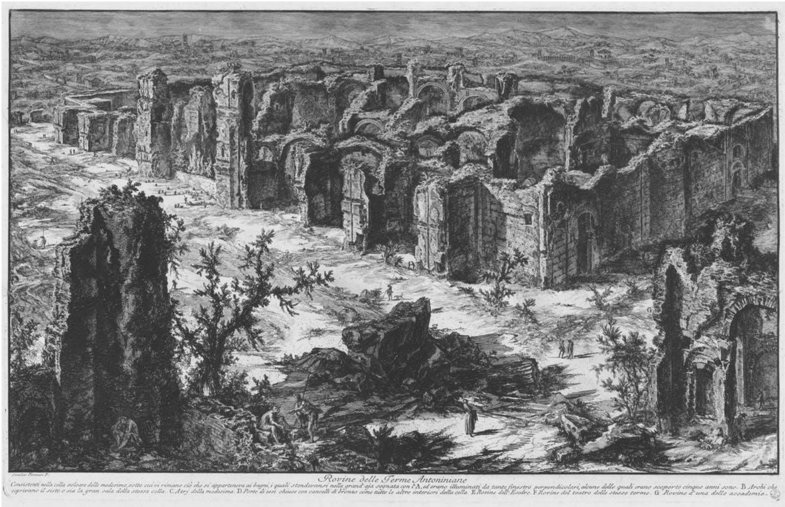
Giovan Battista Piranesi, Rovine delle Terme Antoniniane in 'Le Vedute di Roma