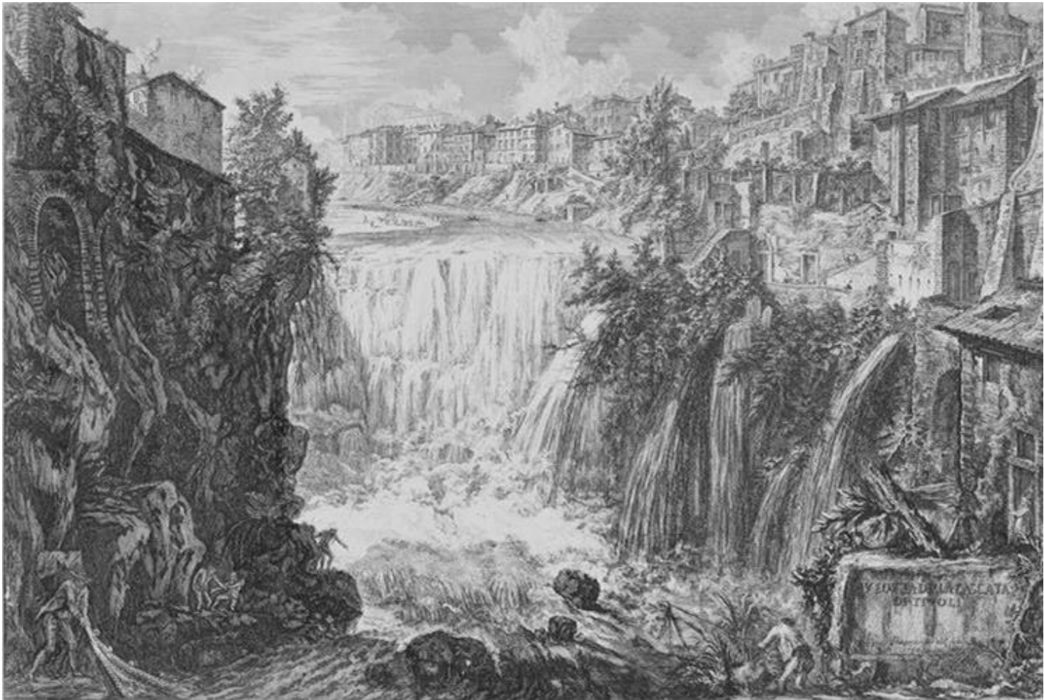
Giovan Battista Piranesi, View of the Grand Cascade at Tivoli