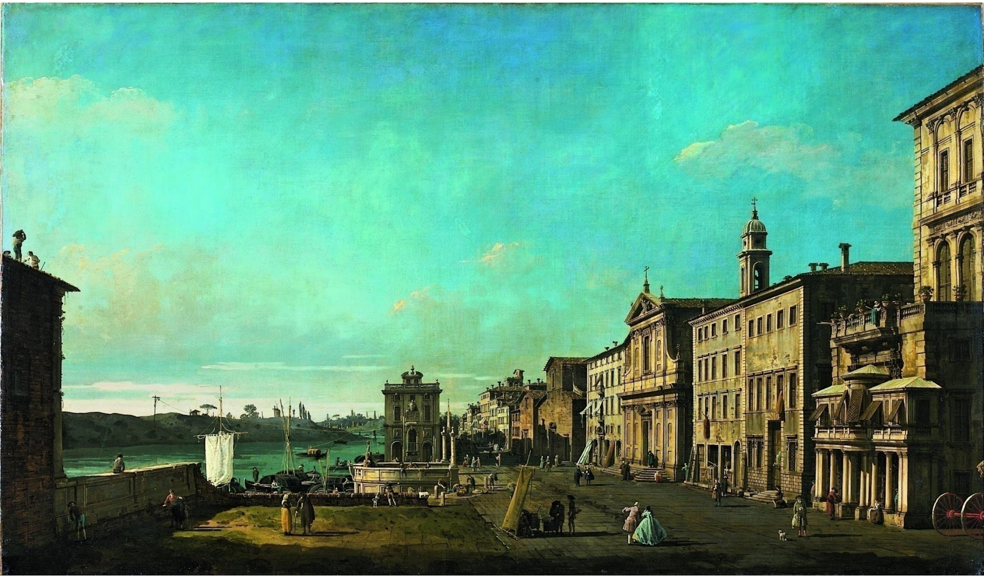
Bernardo Bellotto, Via di Ripetta, 1743-44