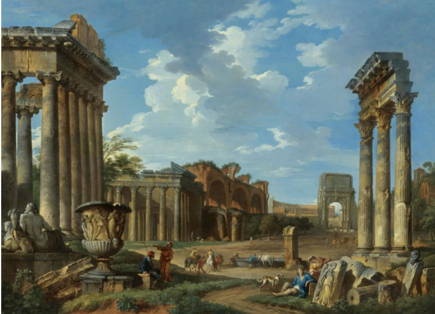
Giovanni Paolo Panini, A View Of The Campo Vaccino