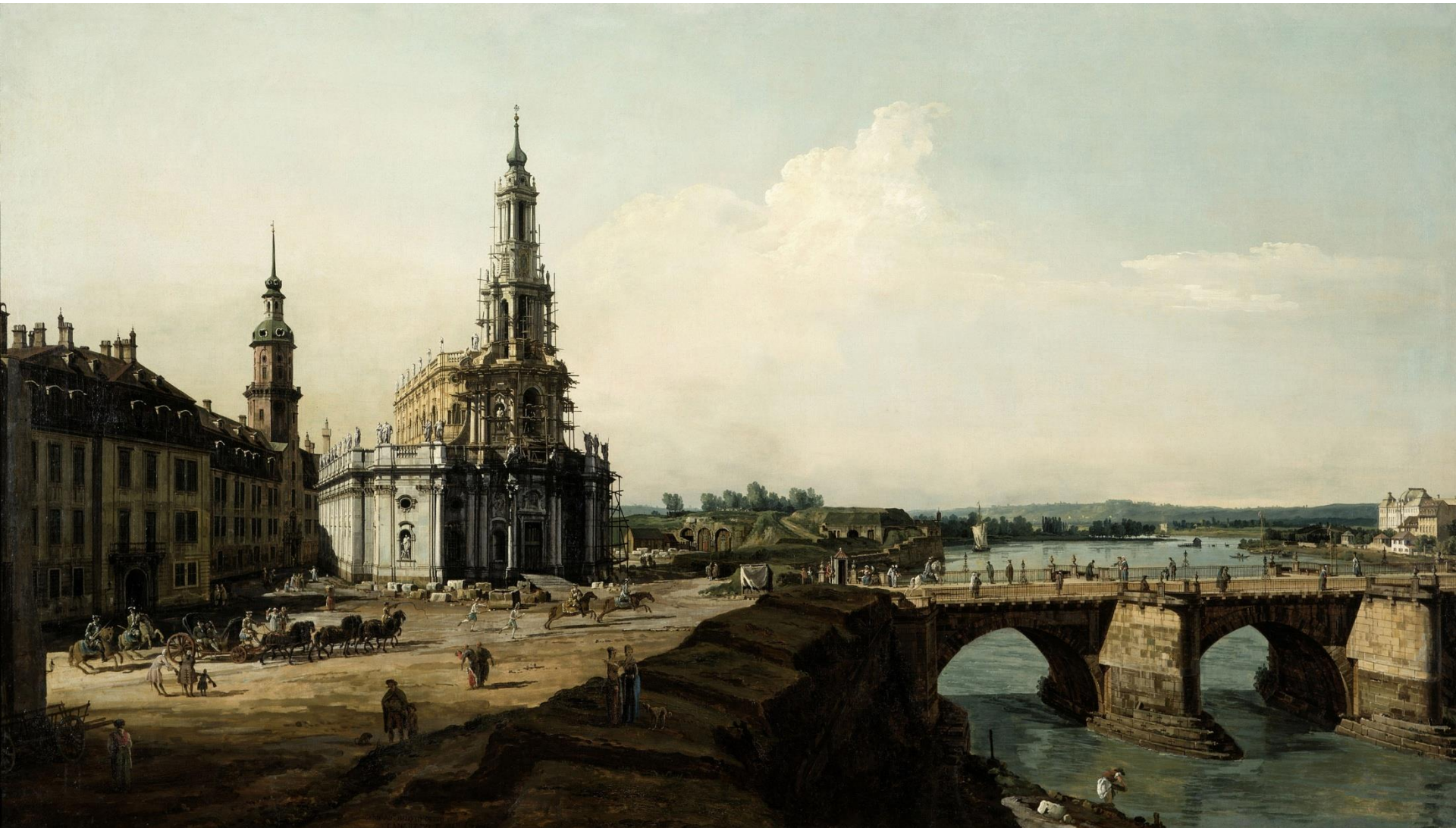
Bernardo Bellotto, Dresden dalla riva sinistra dell'Elba