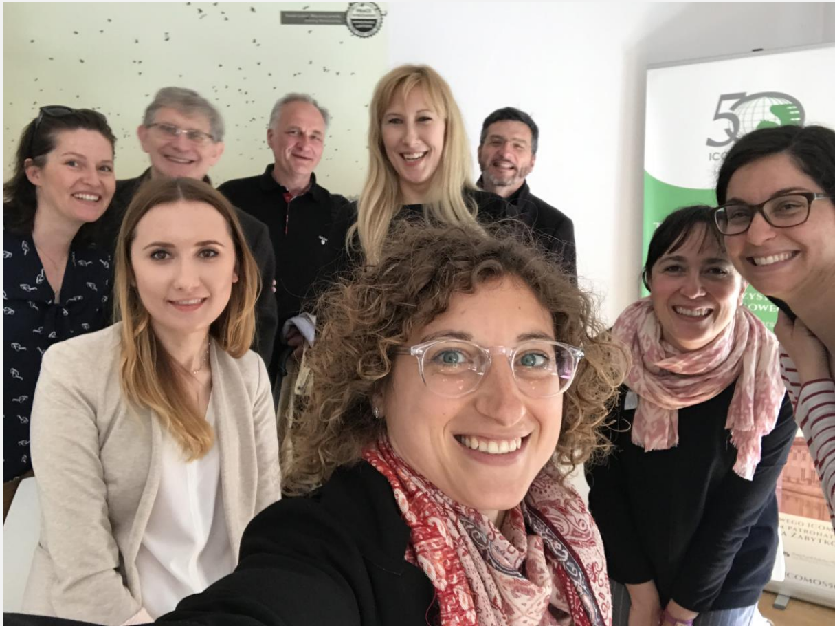
Participants of SURE project quality control and monitoring meeting in Warsaw. Meeting organised by ICOMOS Polska in May, 2017